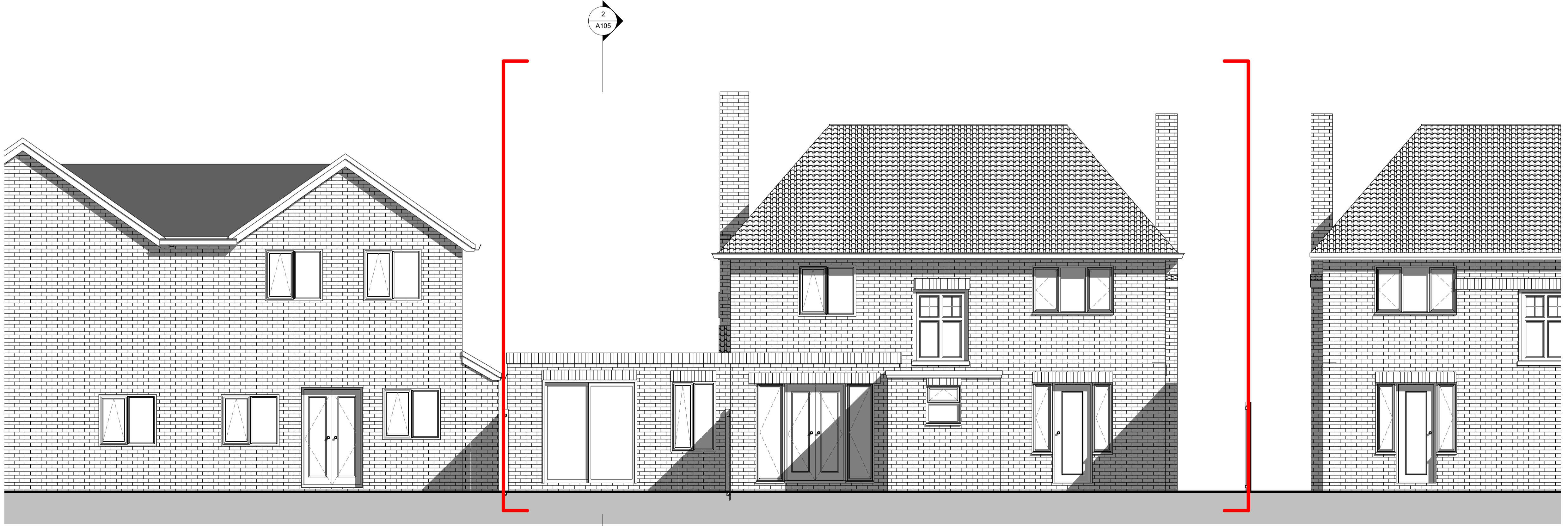
2 Existing N-E Elevation 1 : 50