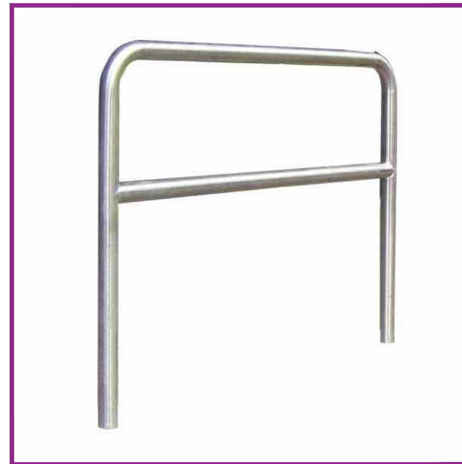
PROPOSED CYCLE STAND LOCATION Scale: 1/50