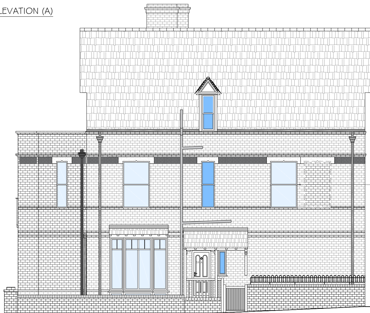
FLANK ELEVATION (B)