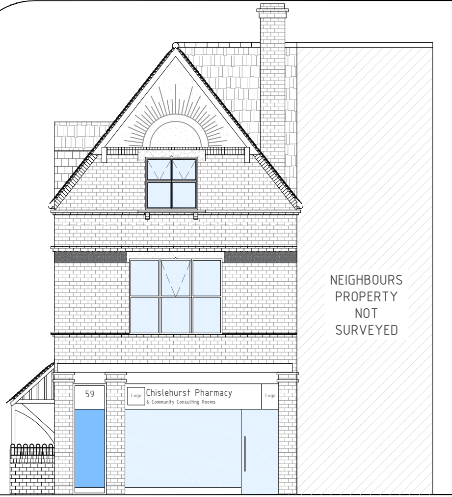
FRONT ELEVATION (A)

GENERAL NOTES: REFER TO P-2 FOR ELEVATION INDICATION COMMUNAL STAIRCASE (FIRE PROTECTED AND ACOUSTIC RATED) FLAT 1 (70.59m 2 ) - FIRST FLOOR 2-BED FLAT FOR 4 PEOPLE FLAT 2 (63.17m 2 ) - SECOND FLOOR 2-BED FLAT FOR 3 PEOPLE