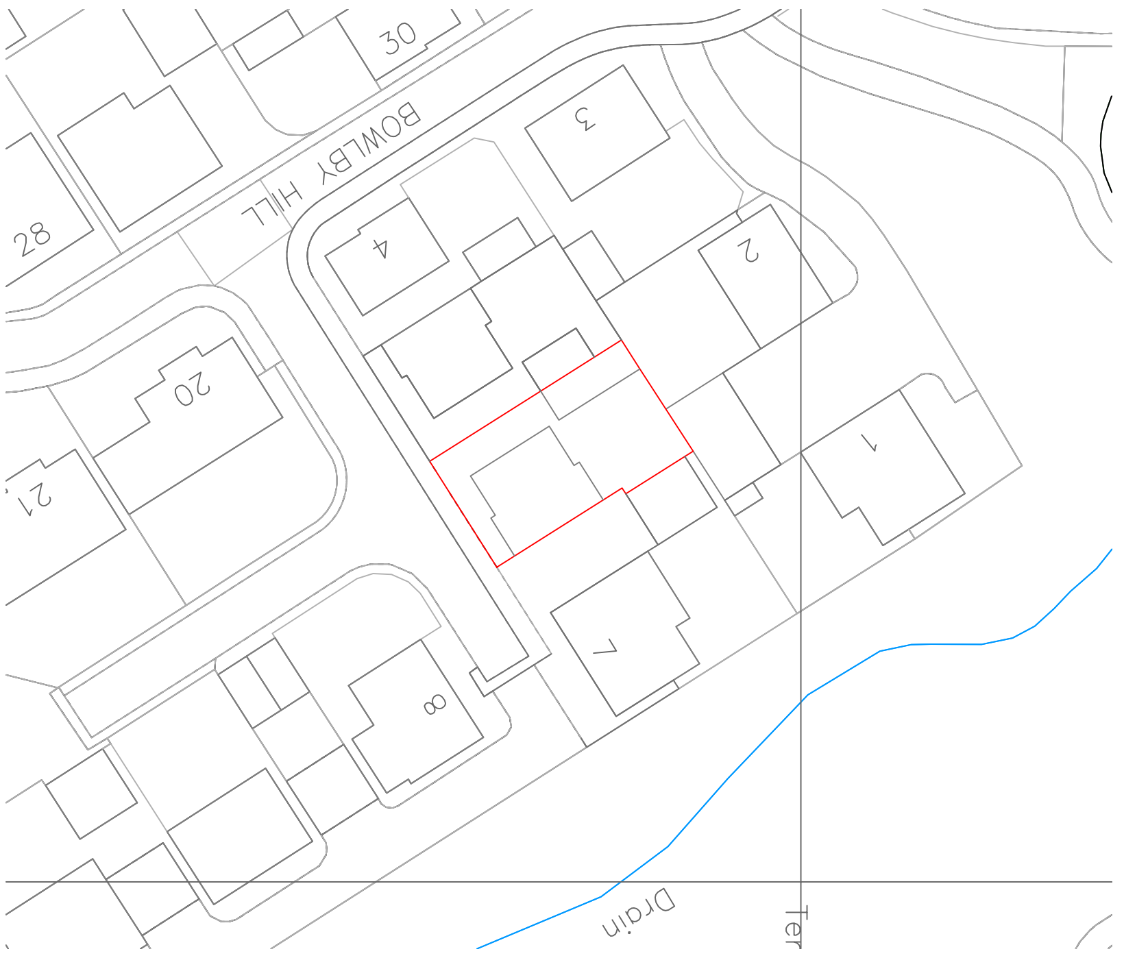
EXISTING BLOCK PLAN 1:500

©Crown Copyright and database rights 2018 OS 100047474.