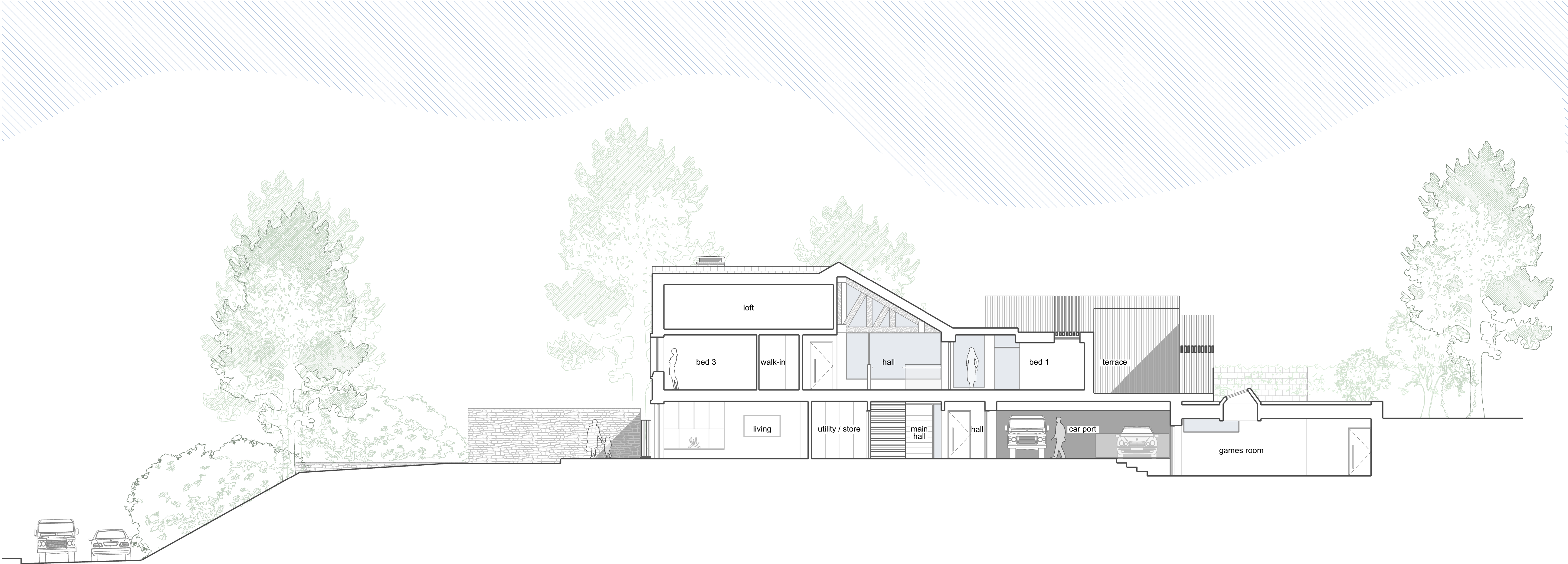
NEW HOUSE: PROPOSED SECTION B-B 1:100 @ A1

Notes: Do not scale from this drawing. All dimensions are in millimetres unless otherwise noted. All dimensions to be checked on site before proceeding with work. All omissions and discrepancies to be reported in writing to Project 3 Architects Ltd. Areas indicated on this drawing are approximate and indicative only. © Project 3 Architects Limited Registered in England & Wales Number 08021795.