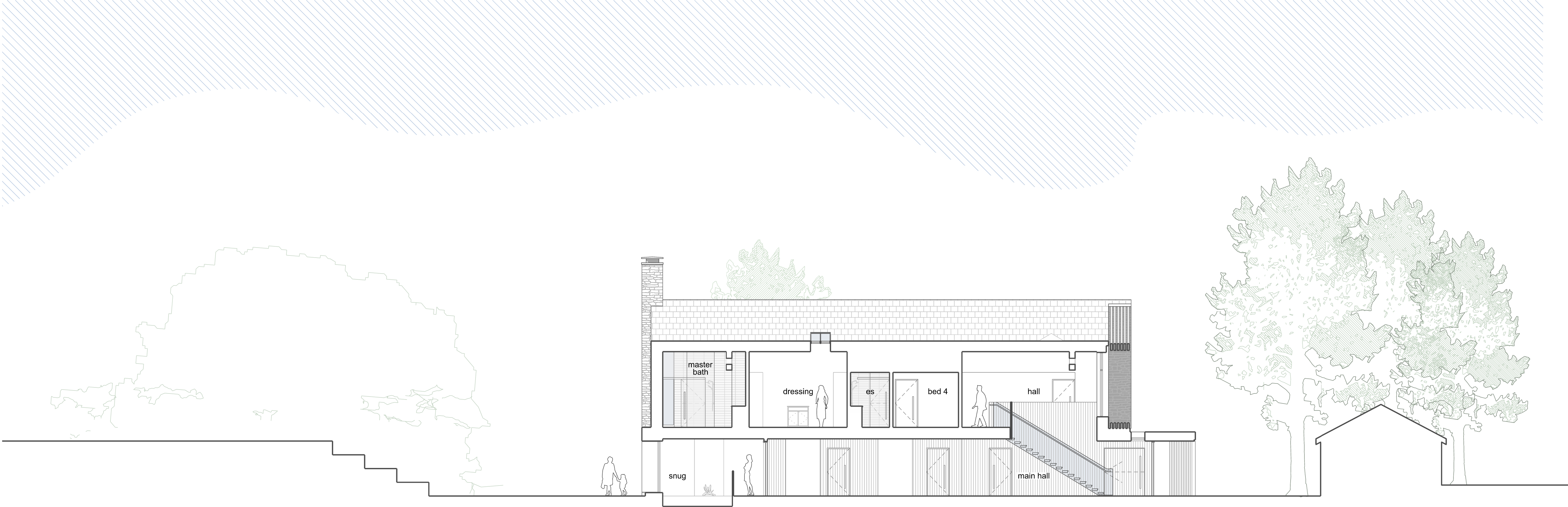
NEW HOUSE: PROPOSED SECTION A-A 1:100 @ A1