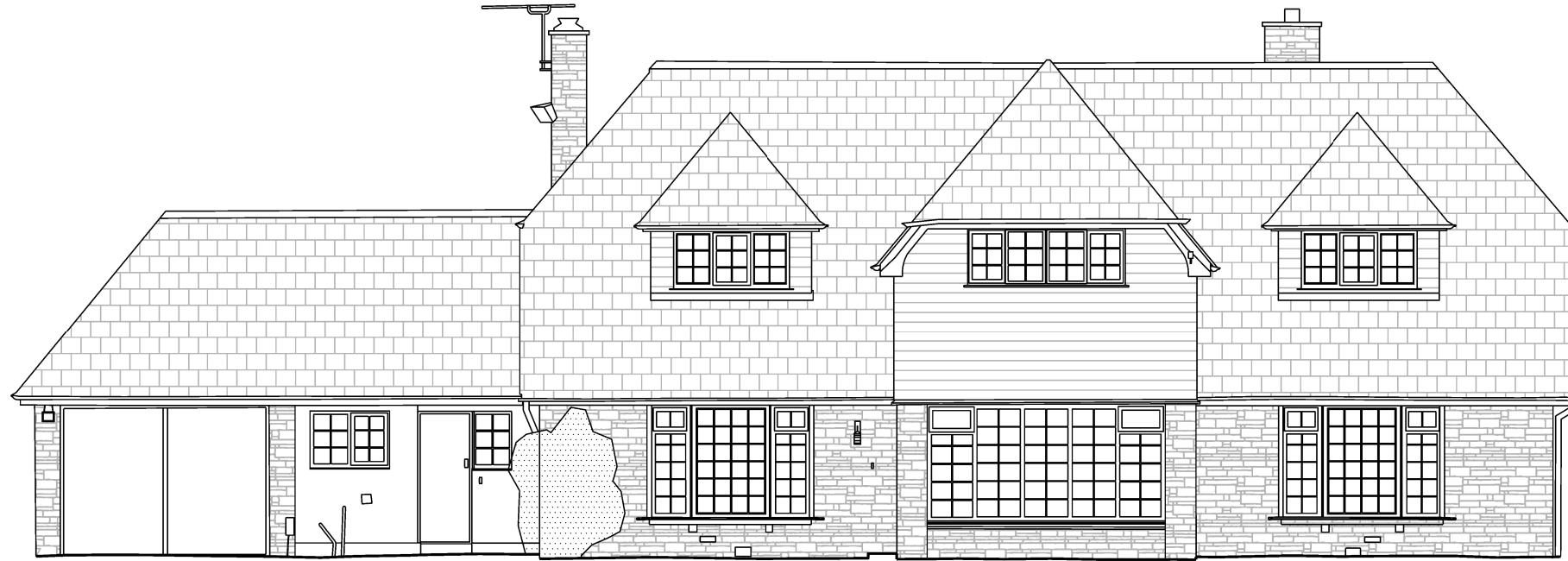
EXISTING ELEVATION 1 1:100@A3