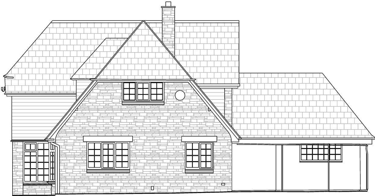
EXISTING ELEVATION 2 1:100@A3

Notes: Do not scale from this drawing. All dimensions are in millimetres unless otherwise noted. All dimensions to be checked on site before proceeding with work. All omissions and discrepancies to be reported in writing to Project 3 Architects Ltd. Areas indicated on this drawing are approximate and indicative only. © Project 3 Architects Limited Registered in England & Wales Number 08021795.