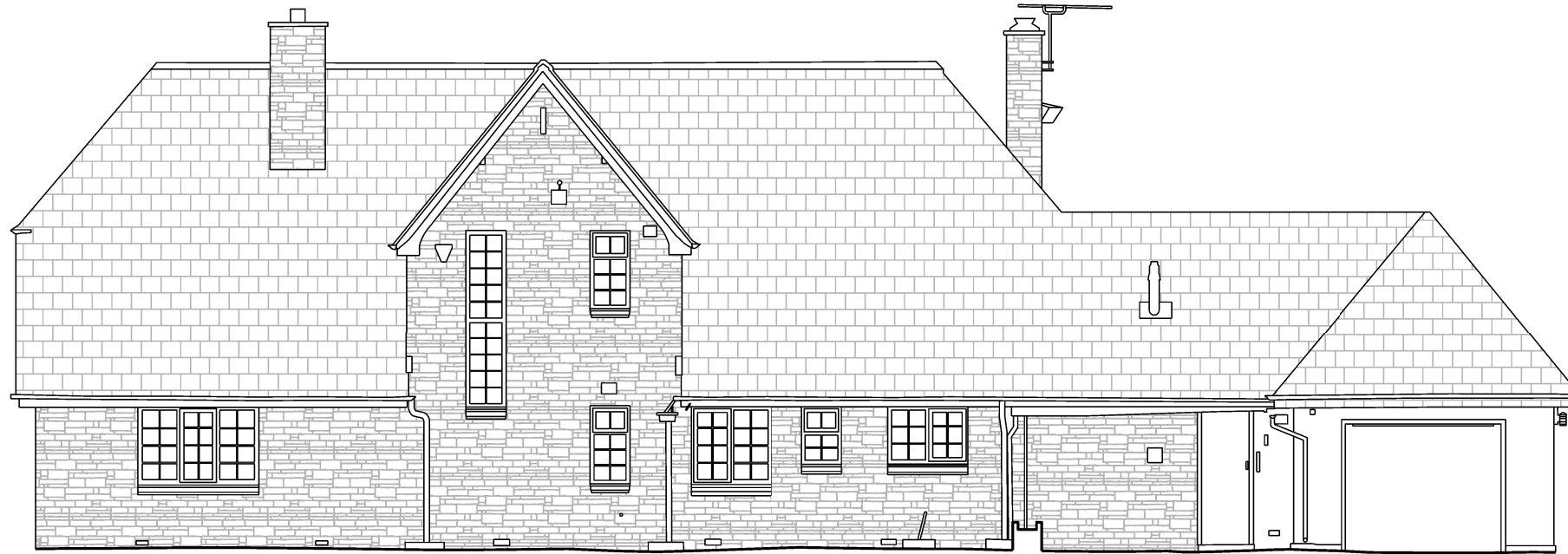
MAIN HOUSE: EXISTING ELEVATION 3 1:100@A3