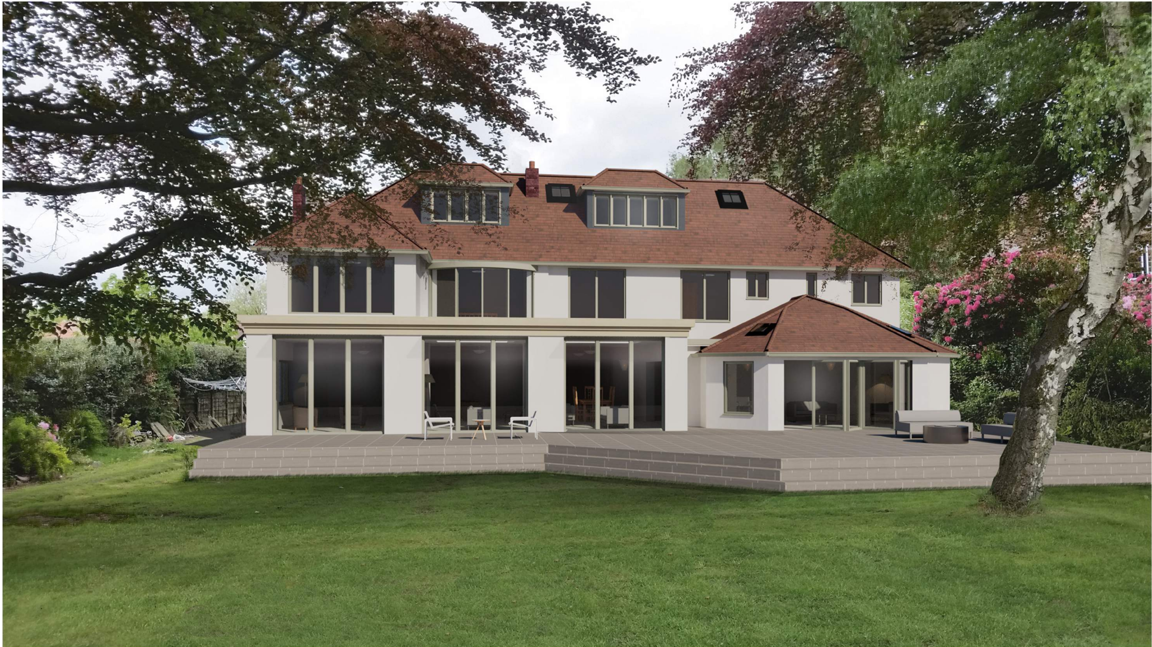
PROPOSED REAR PERSPECTIVE

NOTES Design & drawings are copyright of Hive Architects Studio Ltd. and written permission must be obtained before duplication Do not scale from drawing or derive dimensions from digital forms All dimensions are to be checked before commencing work or placing orders Any discrepancy found between information herein and that given elsewhere or found on site shall be reported in writing to the architect immediately