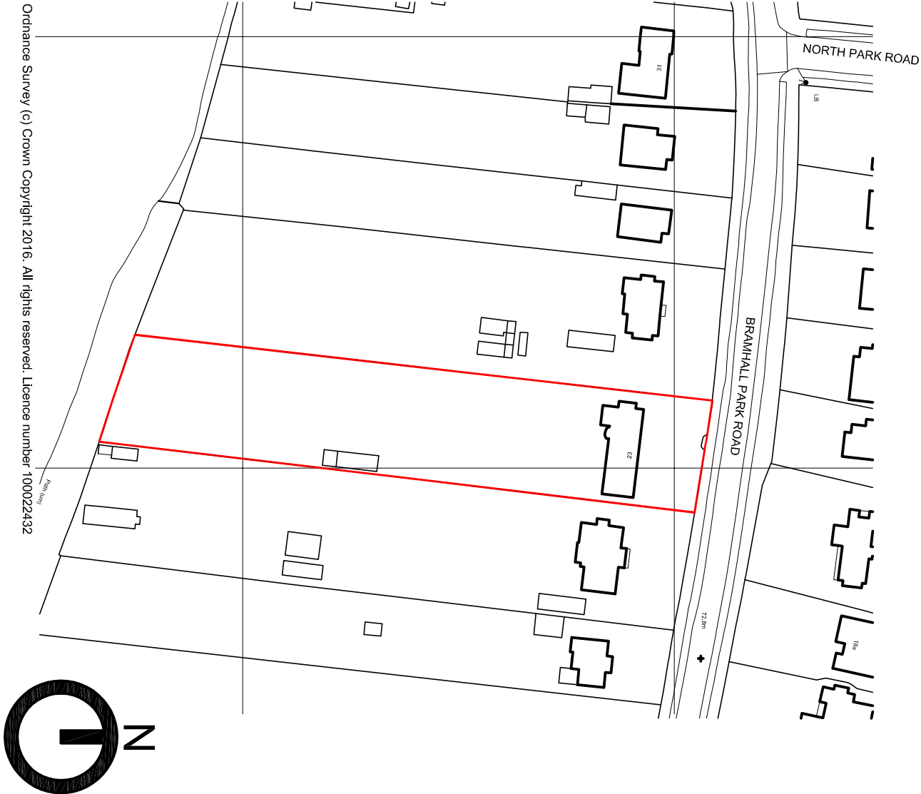
EXISTING SITE LOCATION PLAN 1:1250