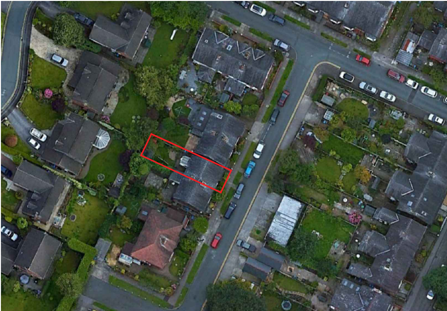
aerial photograph - not to scale