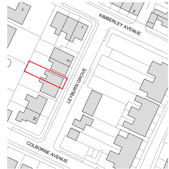
site location plan - scale 1:1250