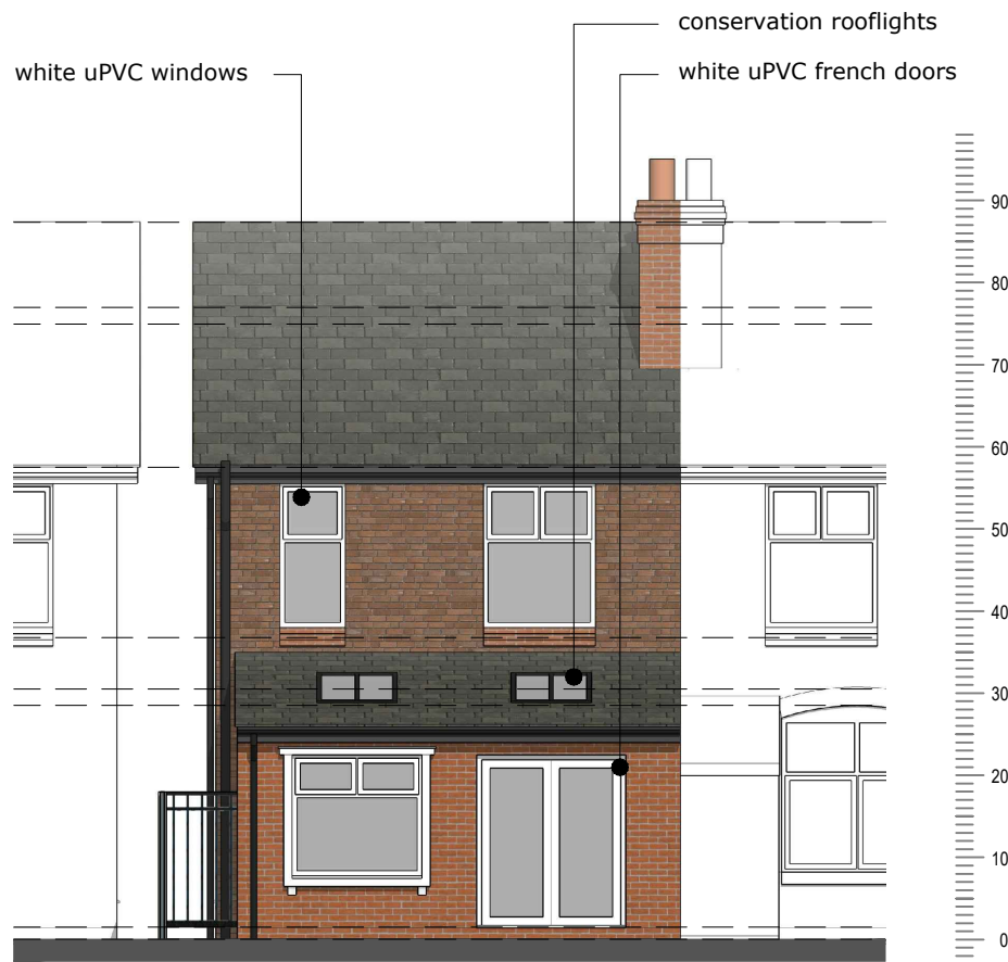
proposed west elevation - scale 1:100