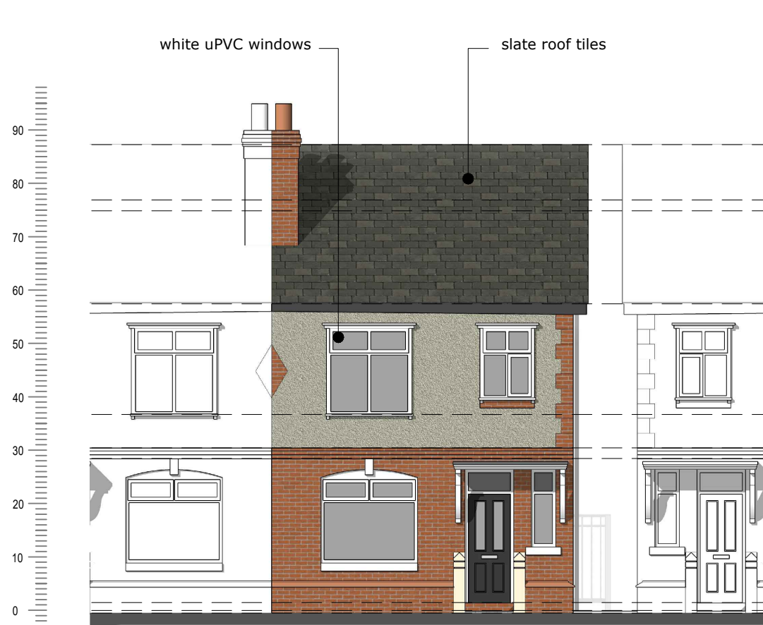
proposed east elevation - scale 1:100