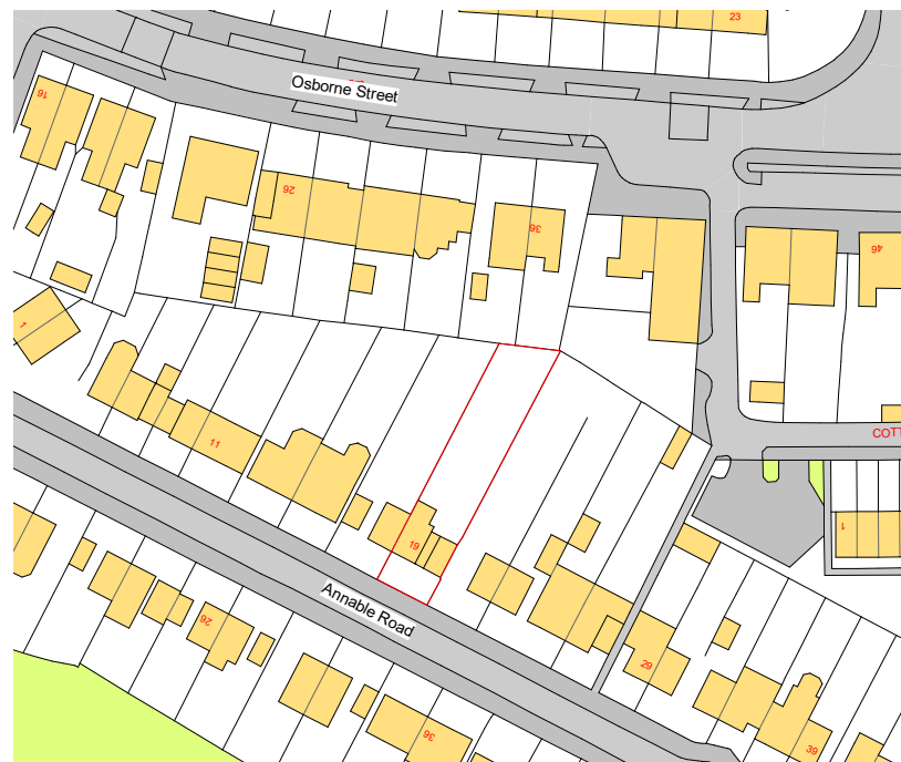
1 Site Location Plan 1 : 1250