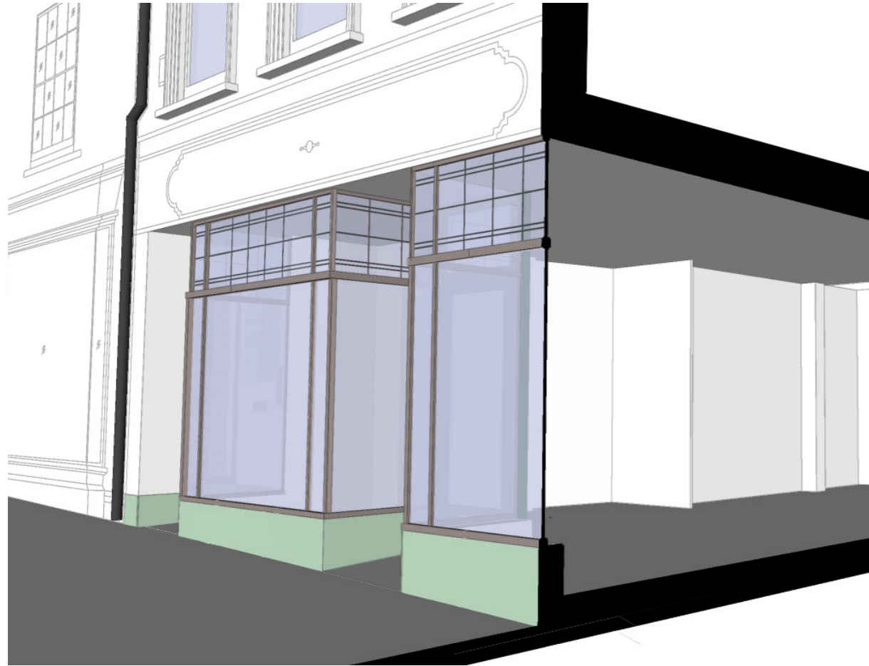
PROPOSED SHOPFRONT: 3D SECTION