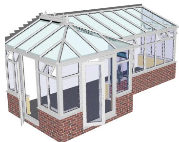
LEFT 3D VIEW