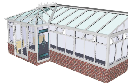
RIGHT 3D VIEW