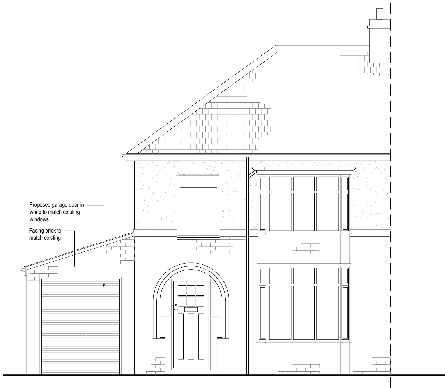
04 PROPOSED FRONT ELEVATION Scale 1:50