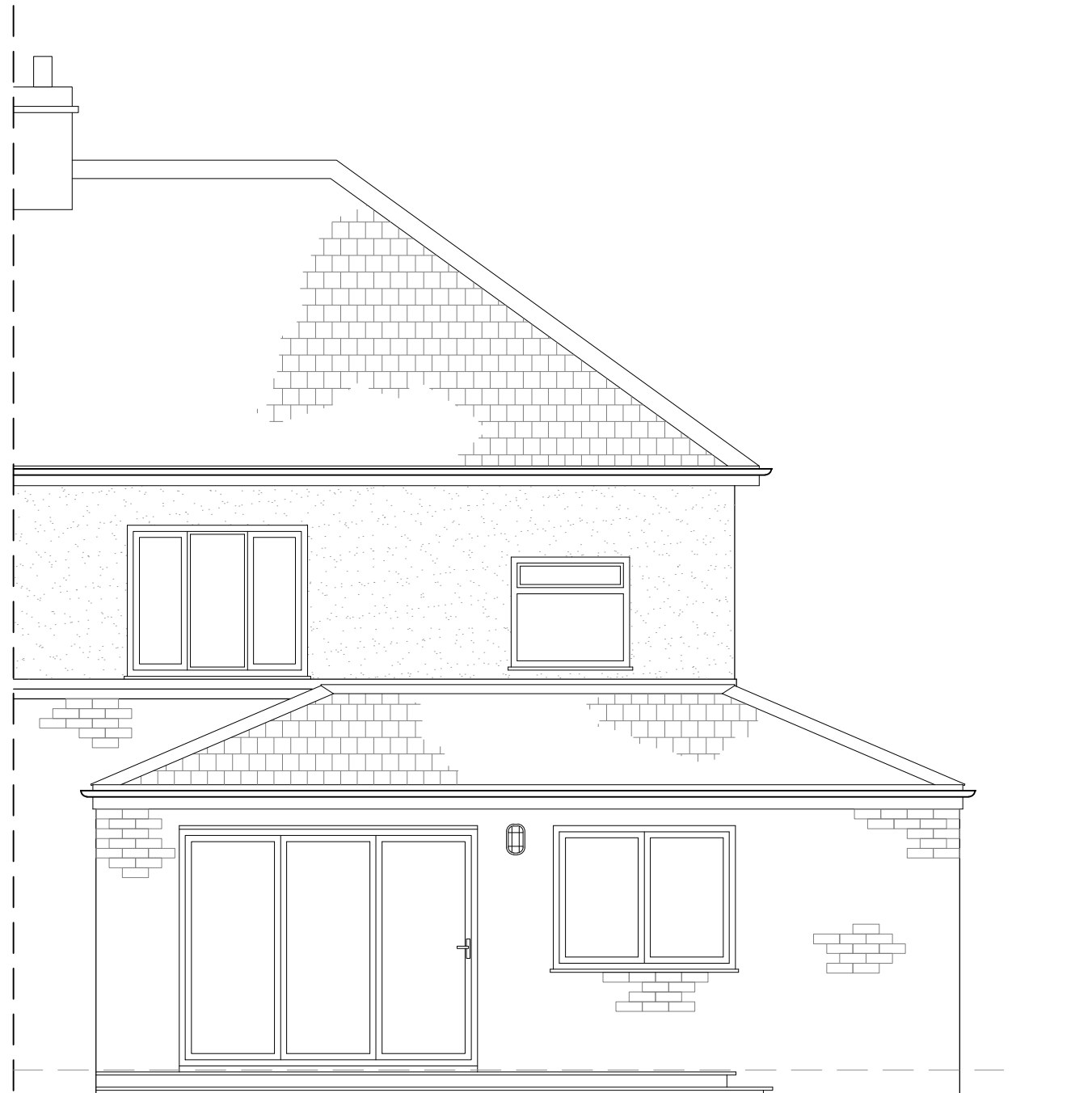
02 EXISTING REAR ELEVATION Scale 1:50