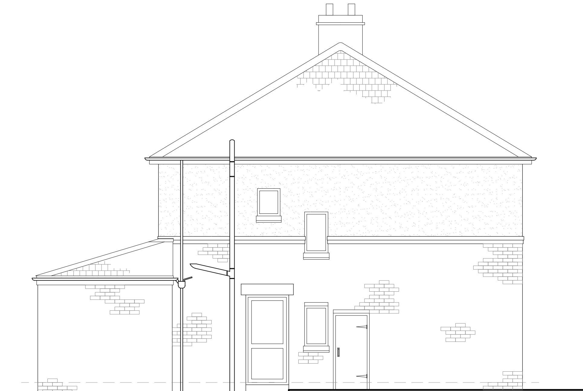
03 EXISTING SIDE ELEVATION