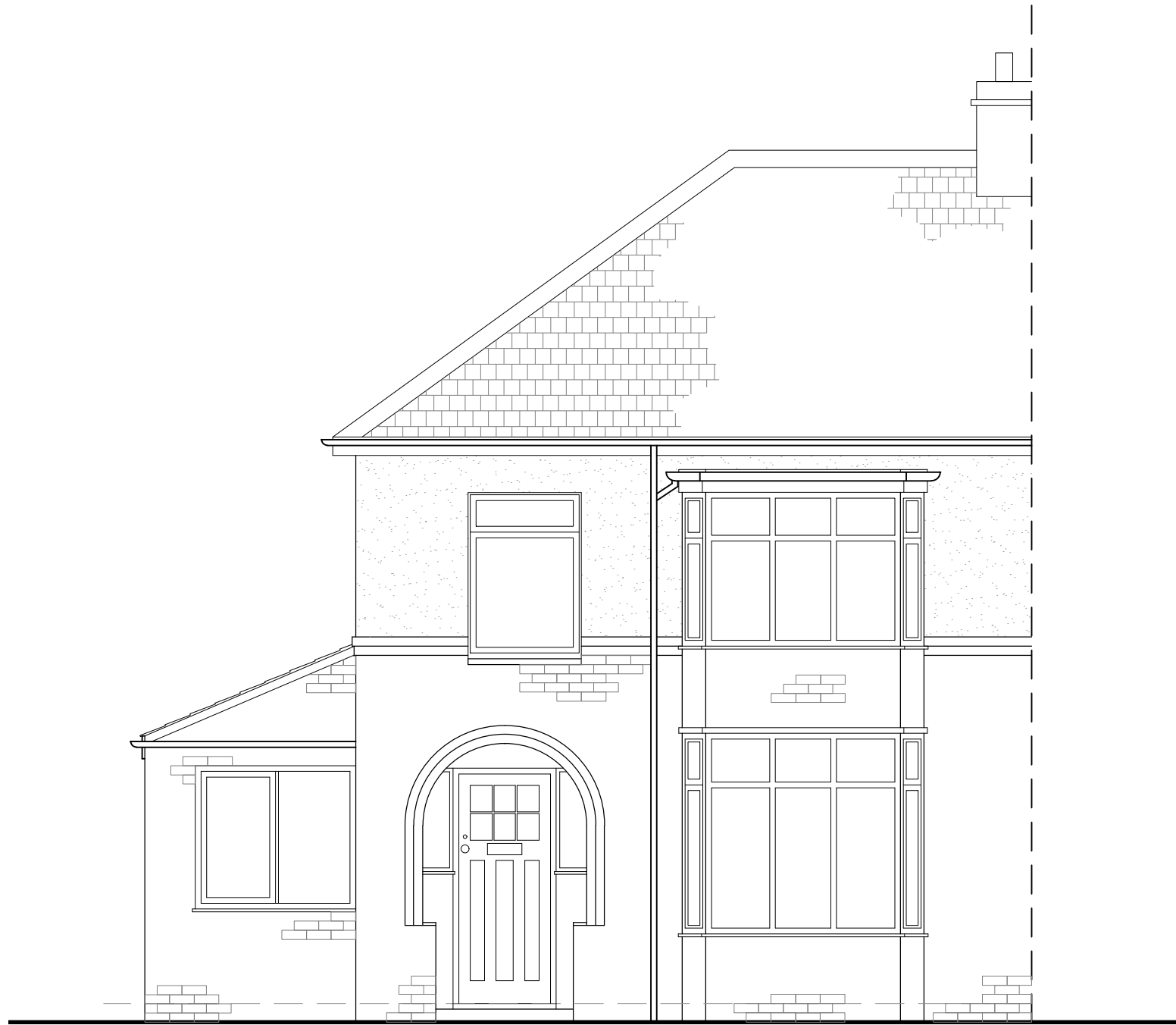
01 EXISTING FRONT ELEVATION Scale 1:50