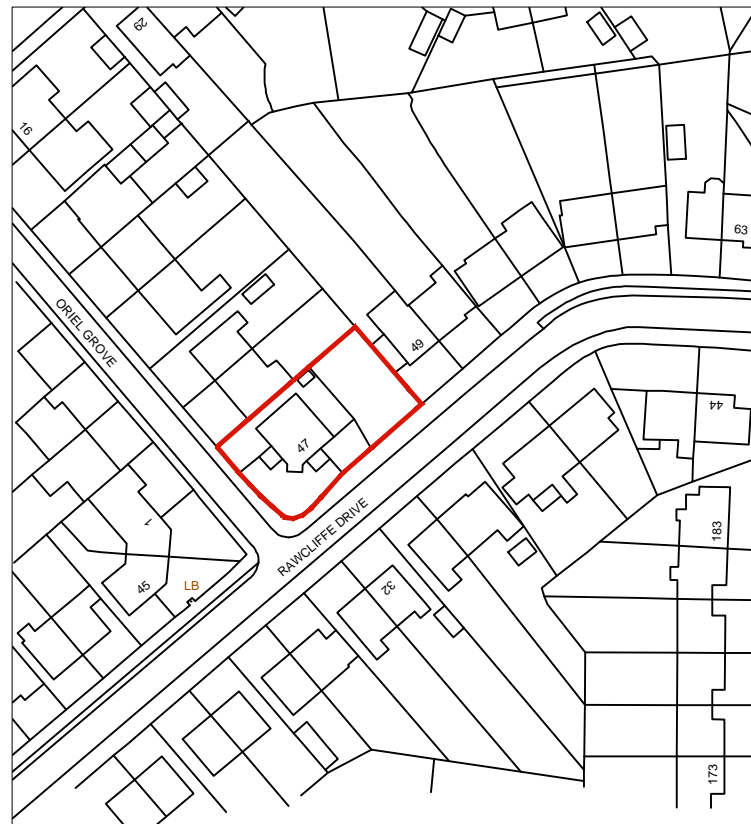
Site Location (1:1250)

Land required for access to the site from the road