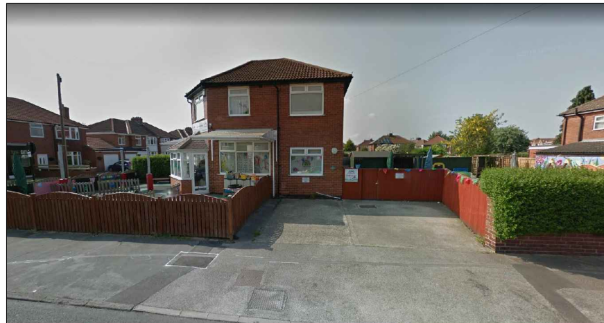
Photo - Front Elevation