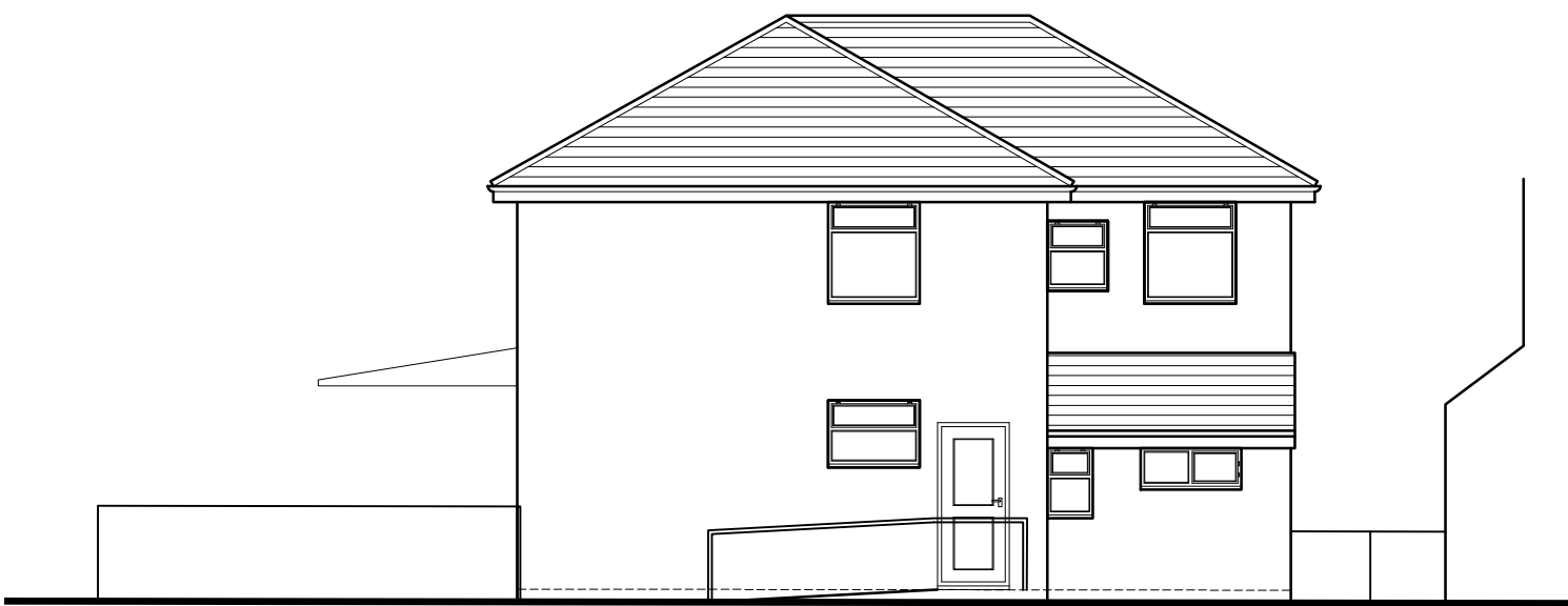
North East Elevation as Existing