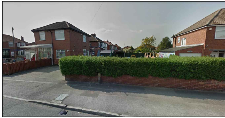
Photo - Side Elevation