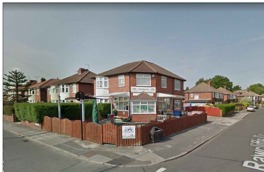
Photo - Front Elevation