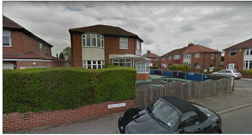
Photo - Front Elevation