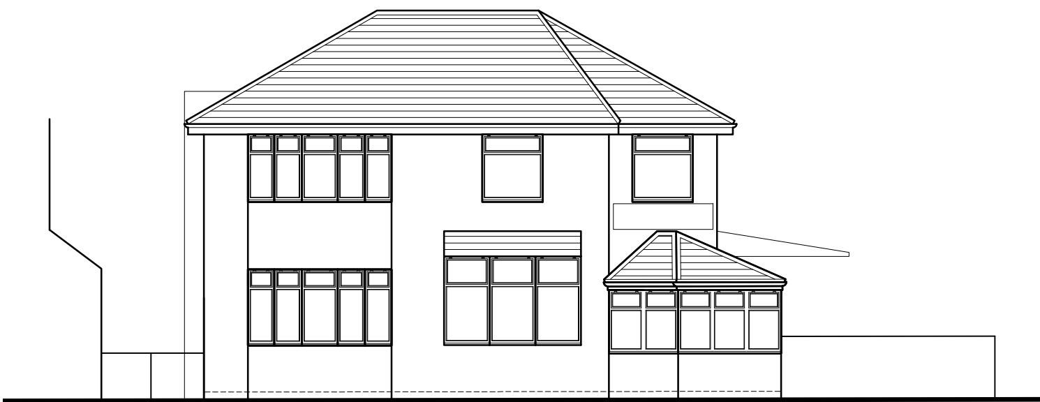
South West Elevation as Existing