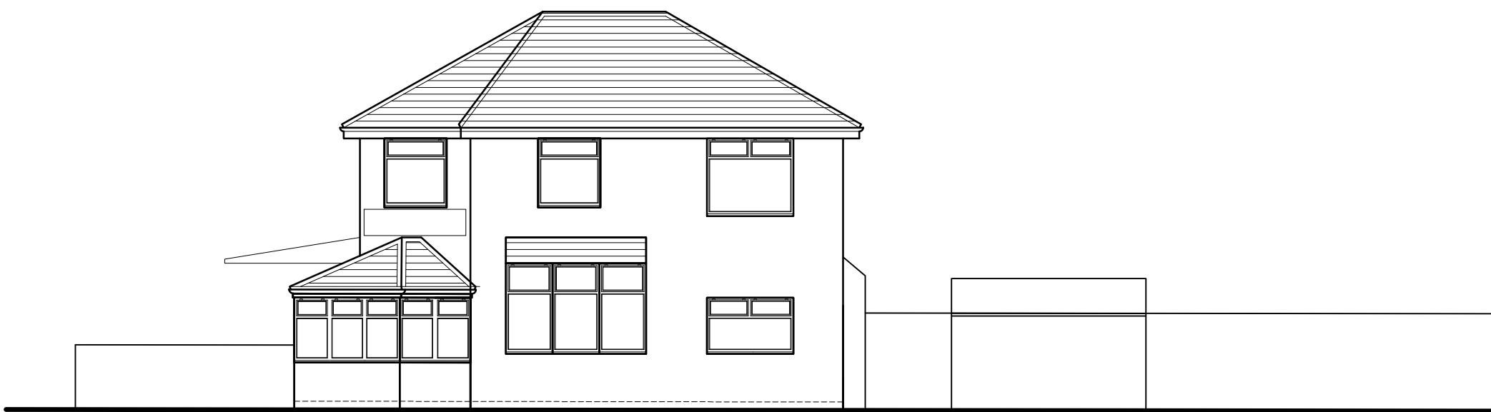
South East Elevation as Existing