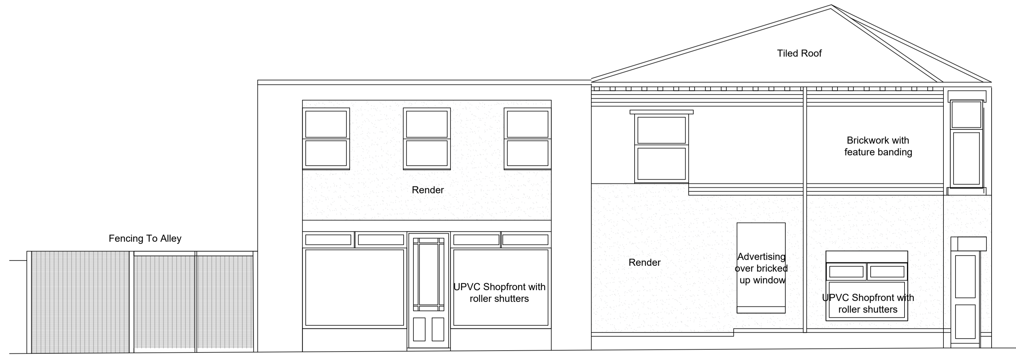
EXISTING BOUNDARY ROAD SIDE ELEVATION Scale 1:50