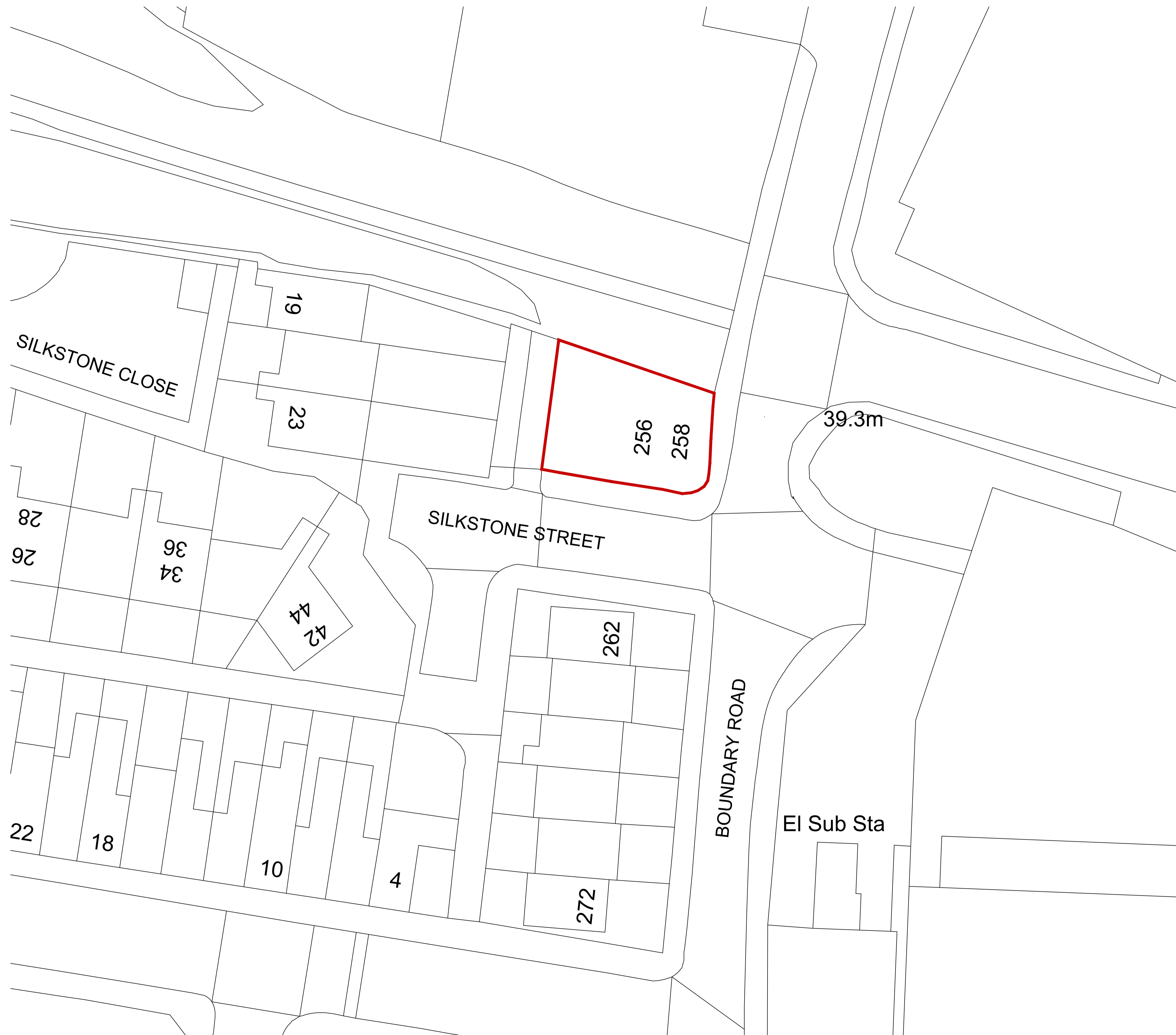
EXISTING SITE PLAN Scale 1:200