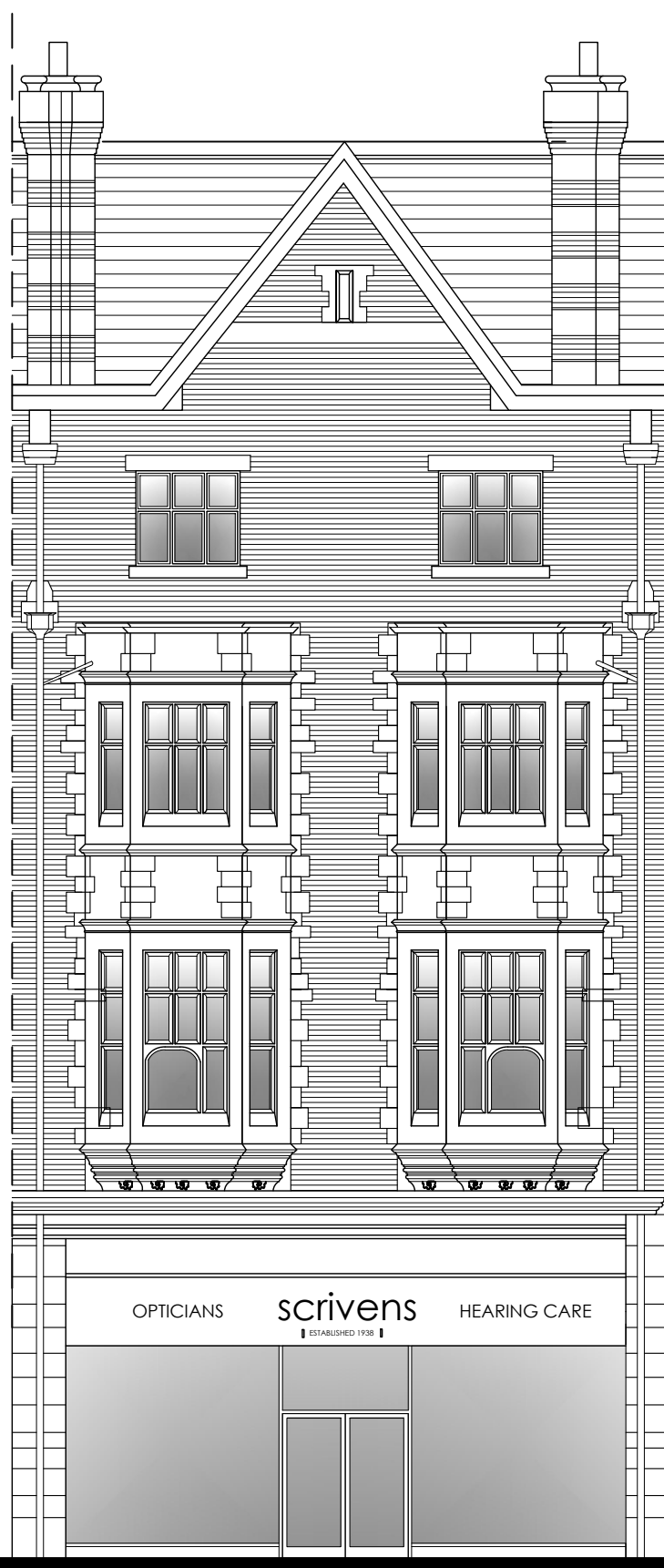
Front Elevation North West Facing

NOTES The copyright of this drawing and design is vested in the Architect and must not be copied or reproduced without written consent. This drawing to be read in conjunction with the specification and other drawings. Do not scale to ascertain dimensions. All dimensions to be checked and verified on site by the responsible contractor prior to commencement of work. Party Wall Act 1996 - The client is the building owner, and as such should take necessary steps to comply with the act where applicable. CDM Regulations 2015 - Sigma Home Solutions are not responsible for the Construction Phase of Health and Safety Requirement, the client must appoint a Principle Designer.