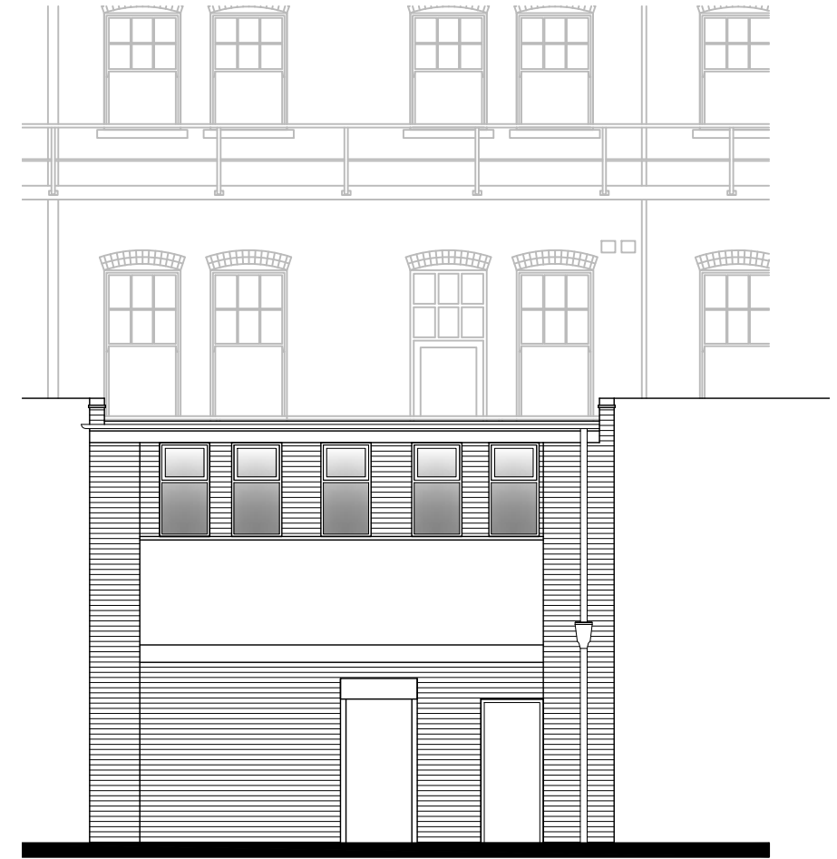
Rear Elevation South Facing