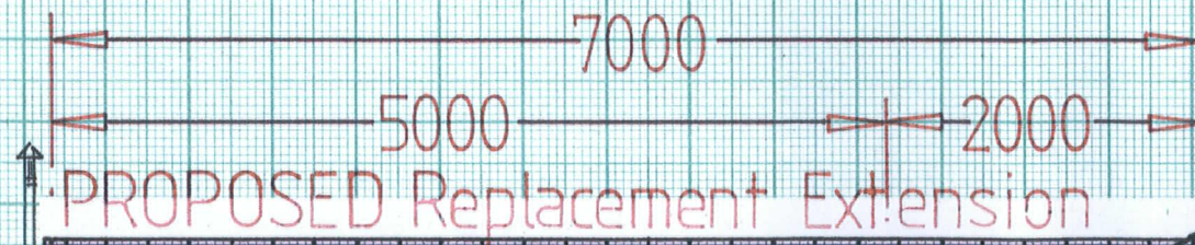
PROPOSED Replacement Extension

7 metres WIDE x 4 metres DEEP x 3.19 metres Maximum HIGH