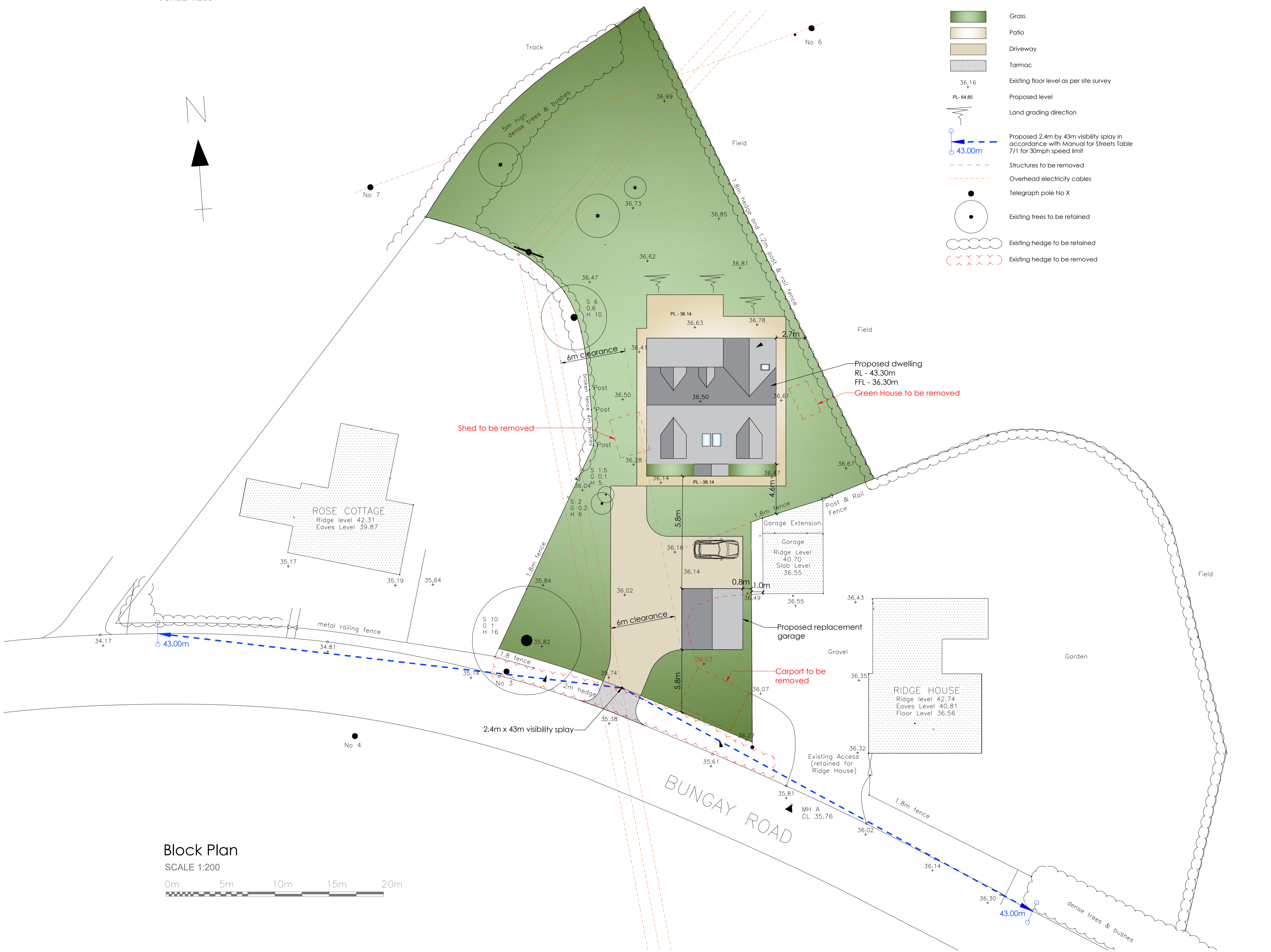
Block Plan SCALE 1:200