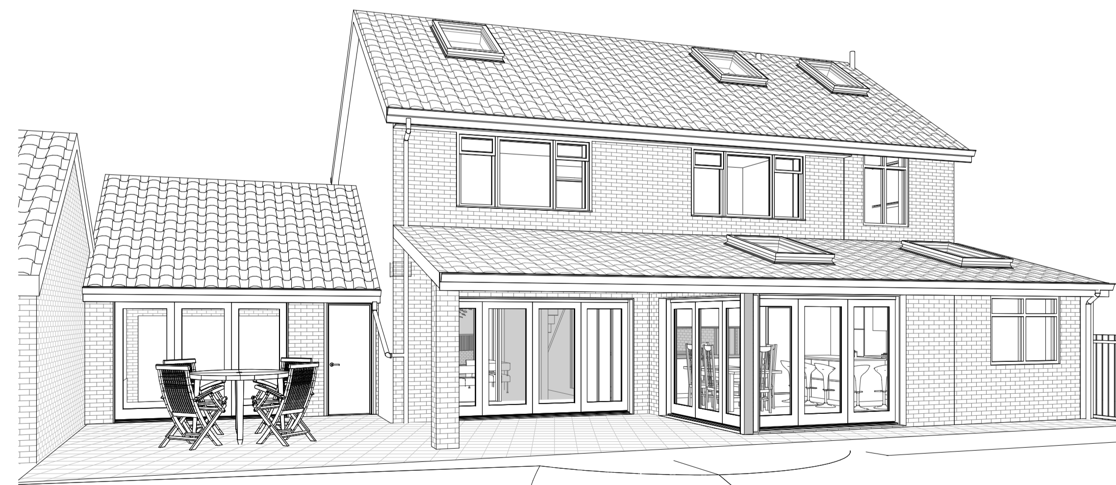
4 Proposed Rear Perspective View