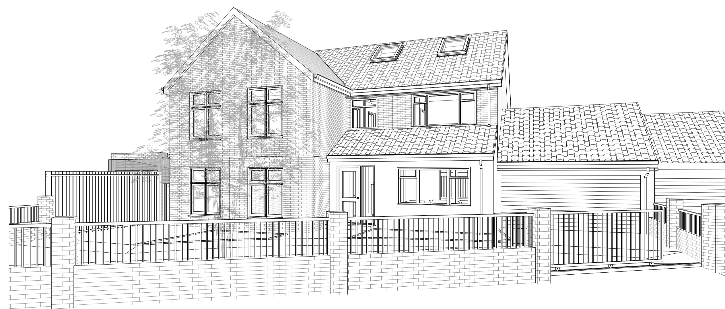
3 Proposed Front Perspective View