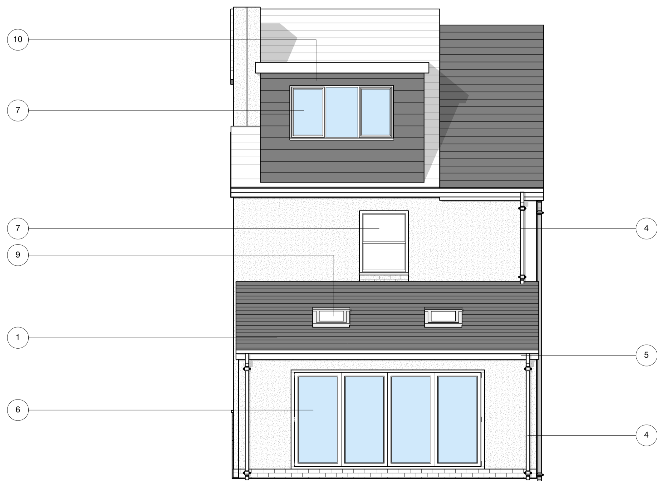
2 Proposed Rear Elevation 1 : 50