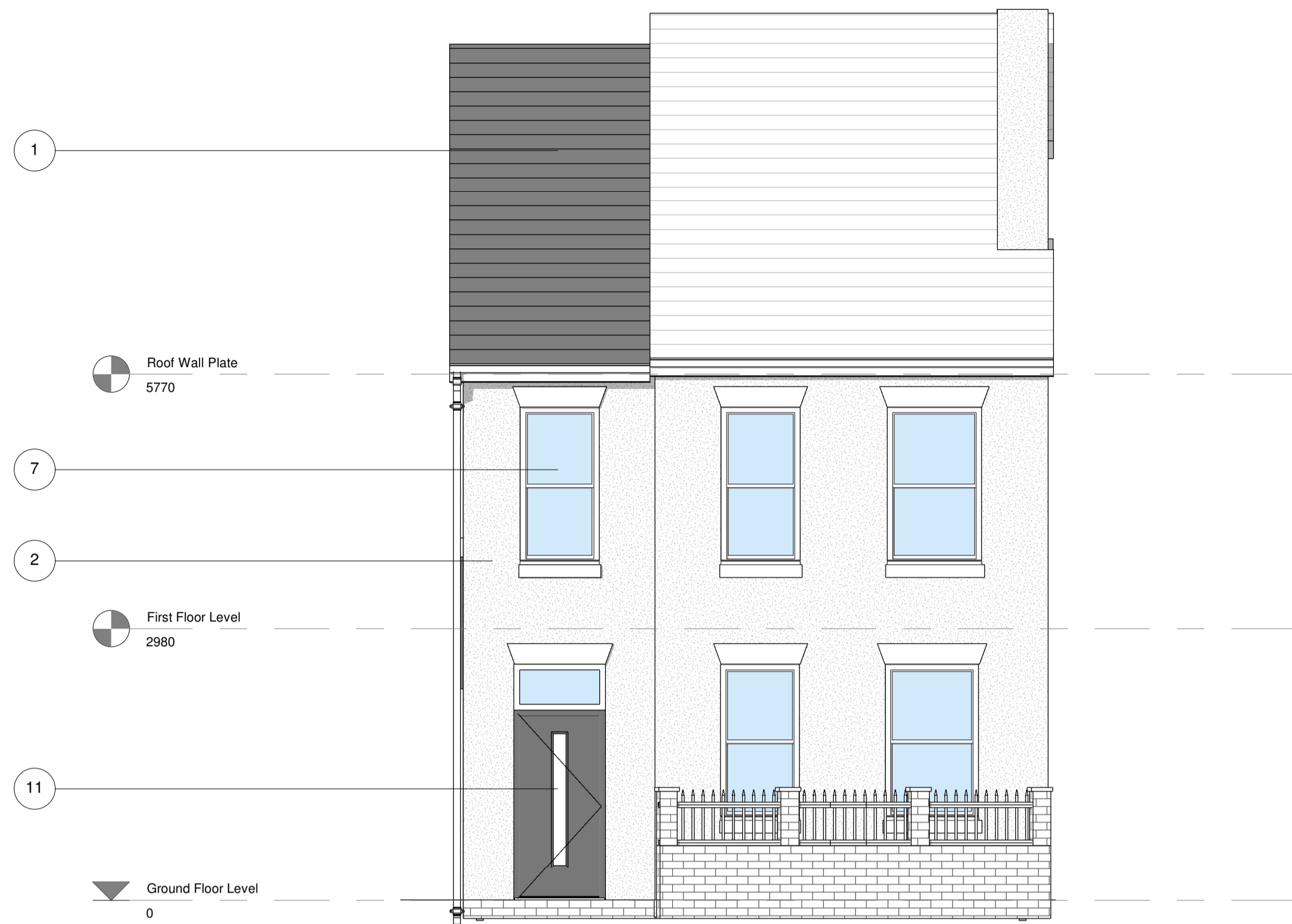
1 Proposed Front Elevation 1 : 50