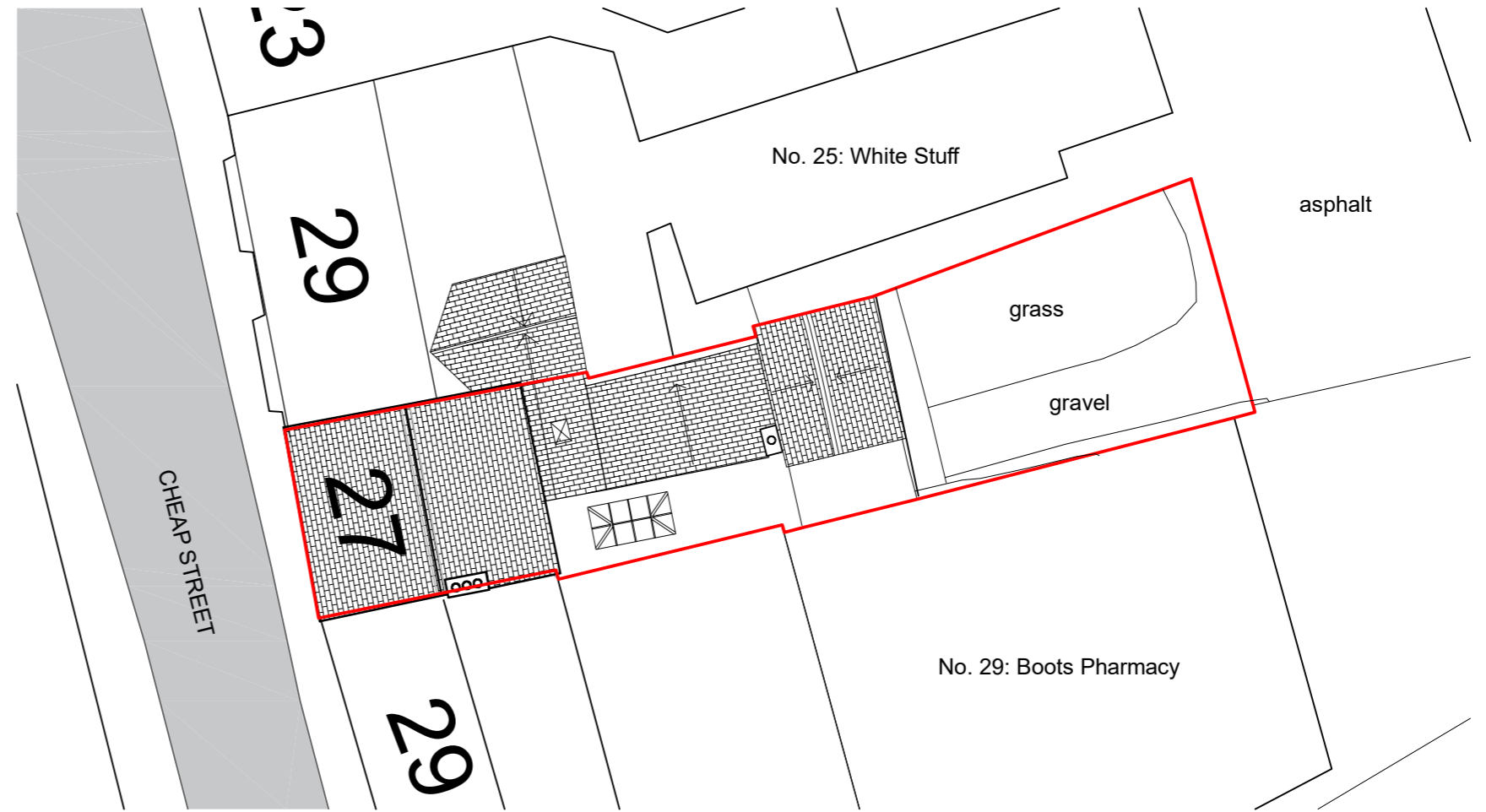
EXISTING SITE PLAN. Scale 1:200