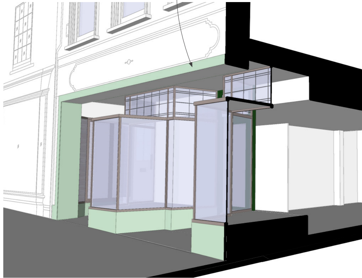
EXISTING SHOPFRONT: 3D SECTION

Downstand (approx 140mm height) has been formed to underside of beam to create deep fascia, allowing for strip of marble cladding to be fixed beneath the painted shopfront signage board