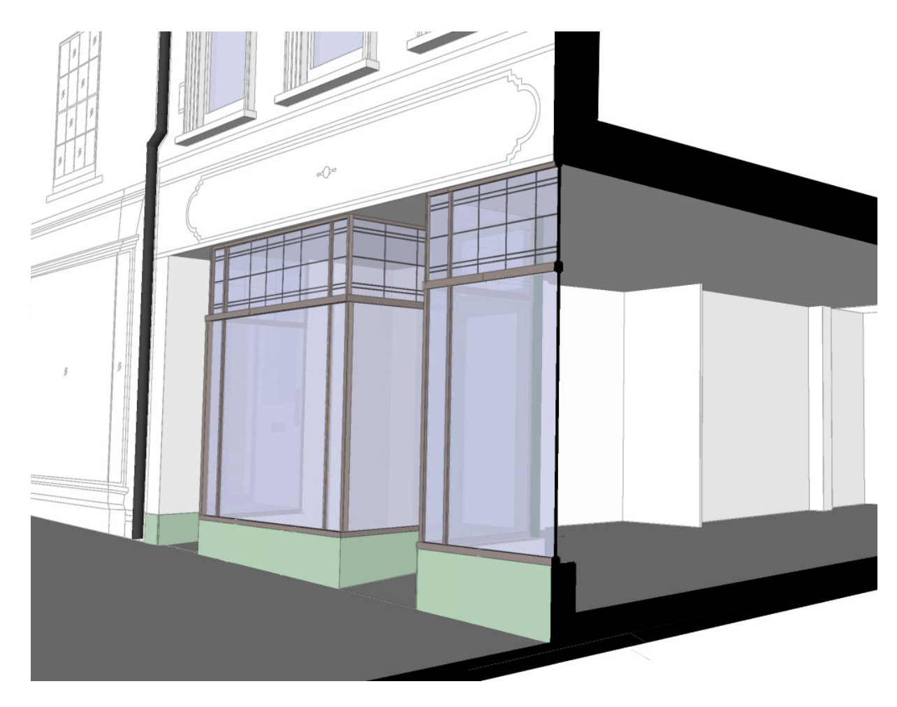
PROPOSED SHOPFRONT: 3D SECTION