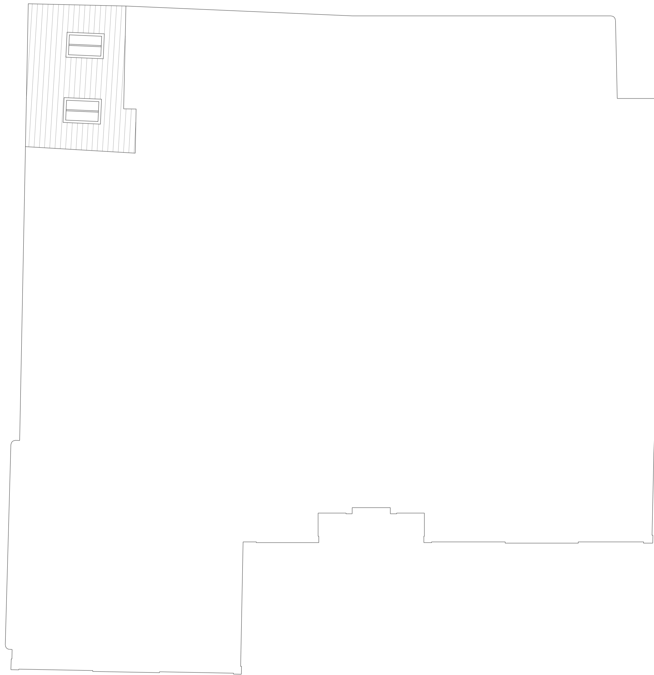
PROPOSED - ROOF PLAN