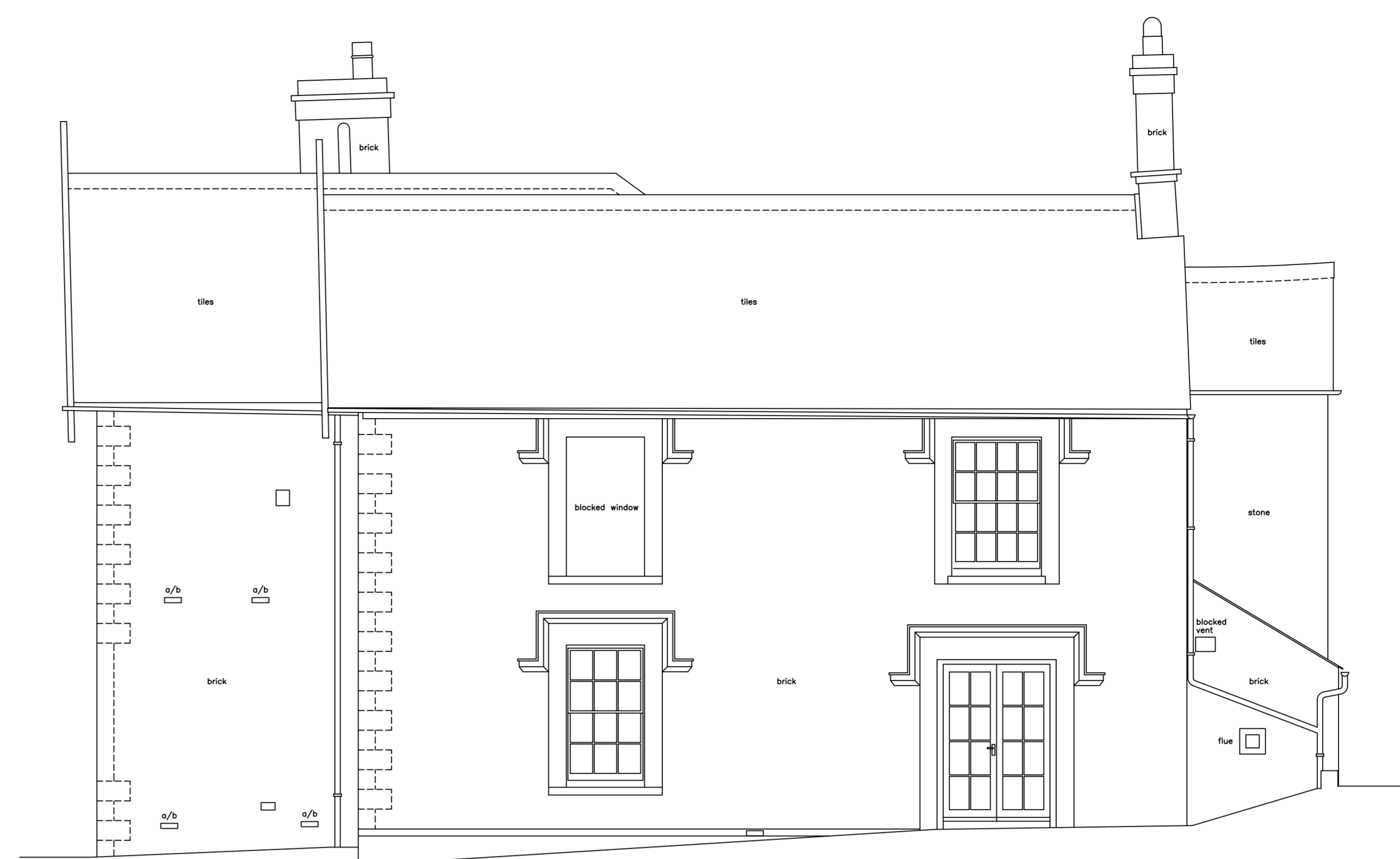
Datum: 98.00 EAST ELEVATION