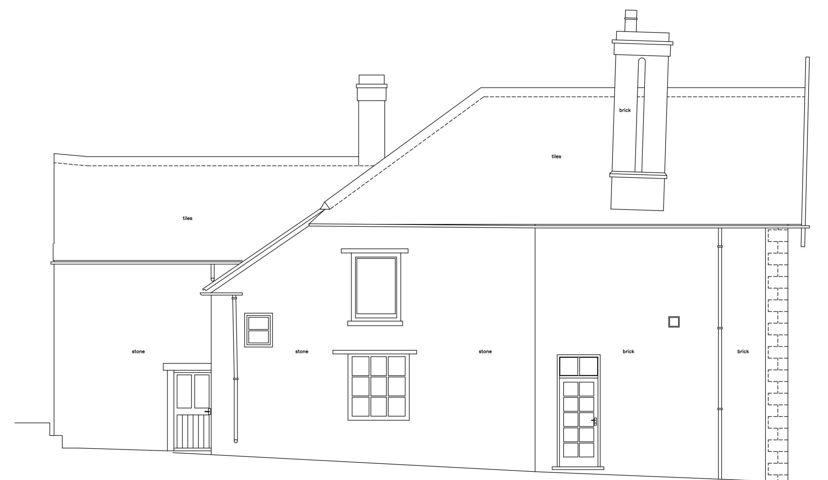
Datum: 98.00 WEST ELEVATION