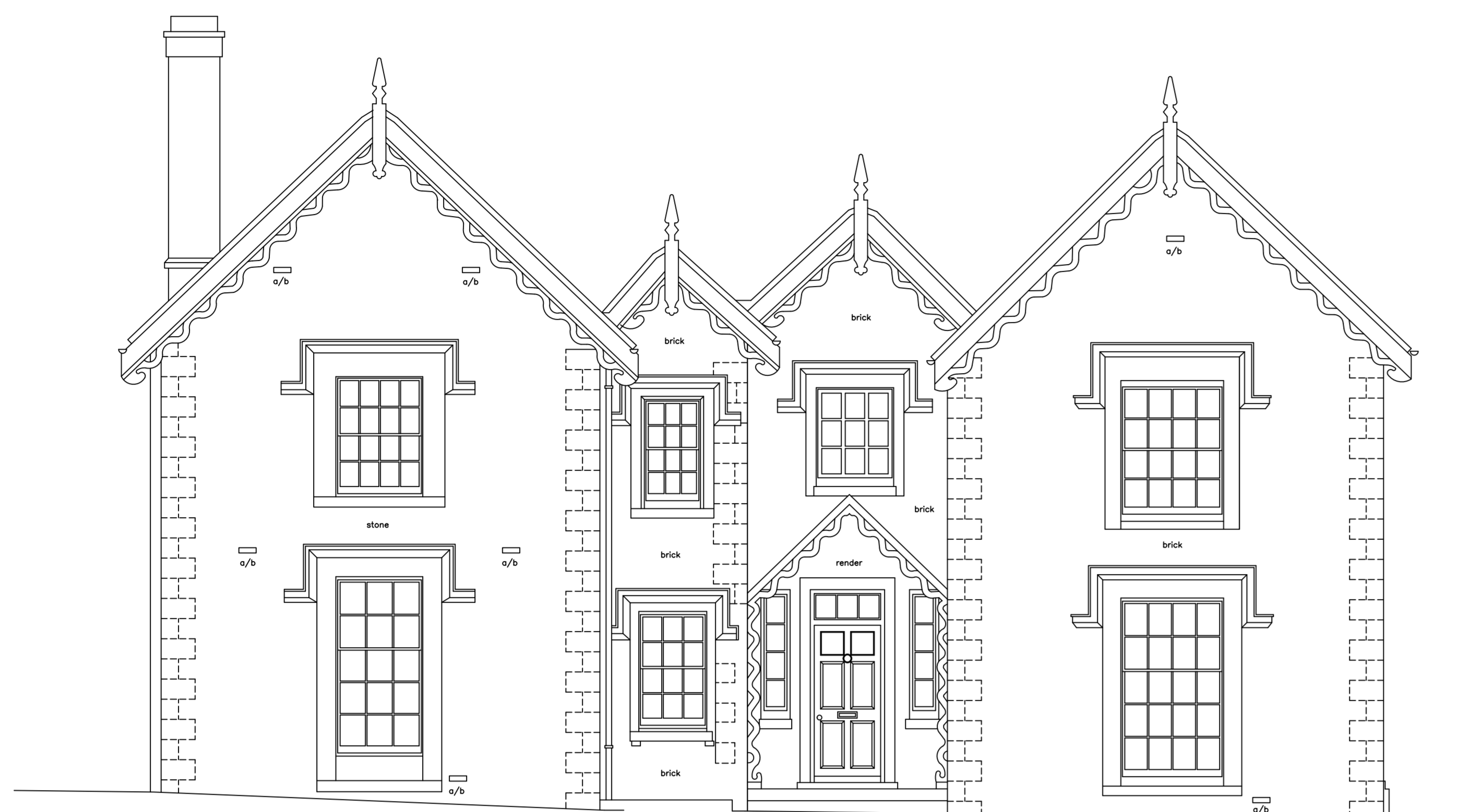
Datum: 98.00 SOUTH ELEVATION