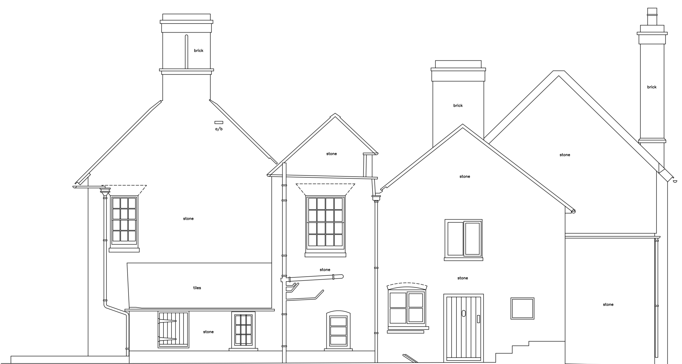
Datum: 98.00 NORTH ELEVATION