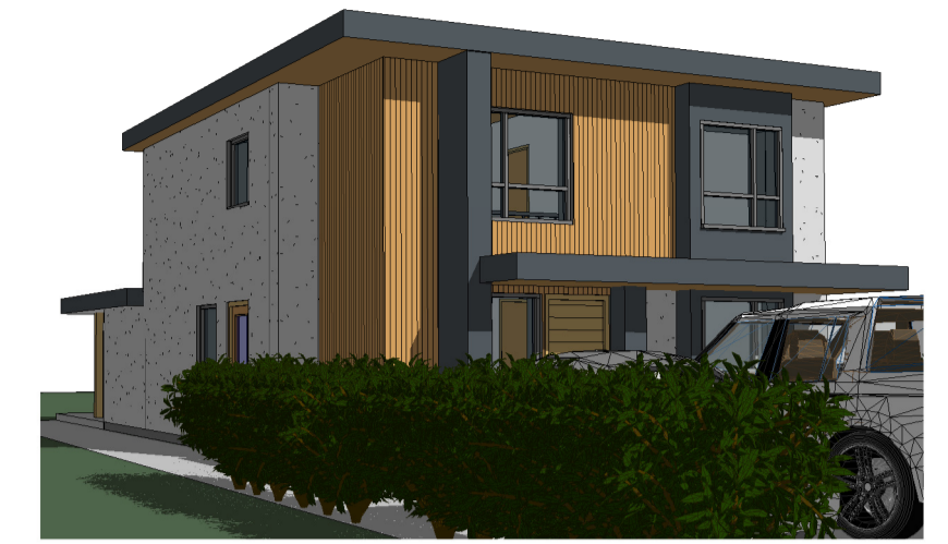
9 View 2