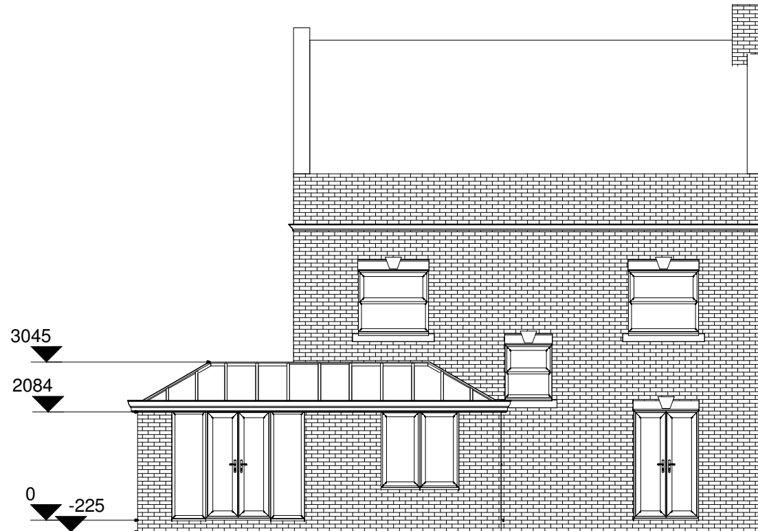
4 Proposed Rear Elevation 1 : 100