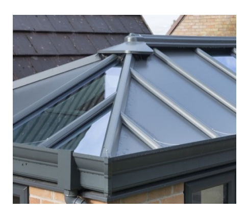
Typical Roof finish