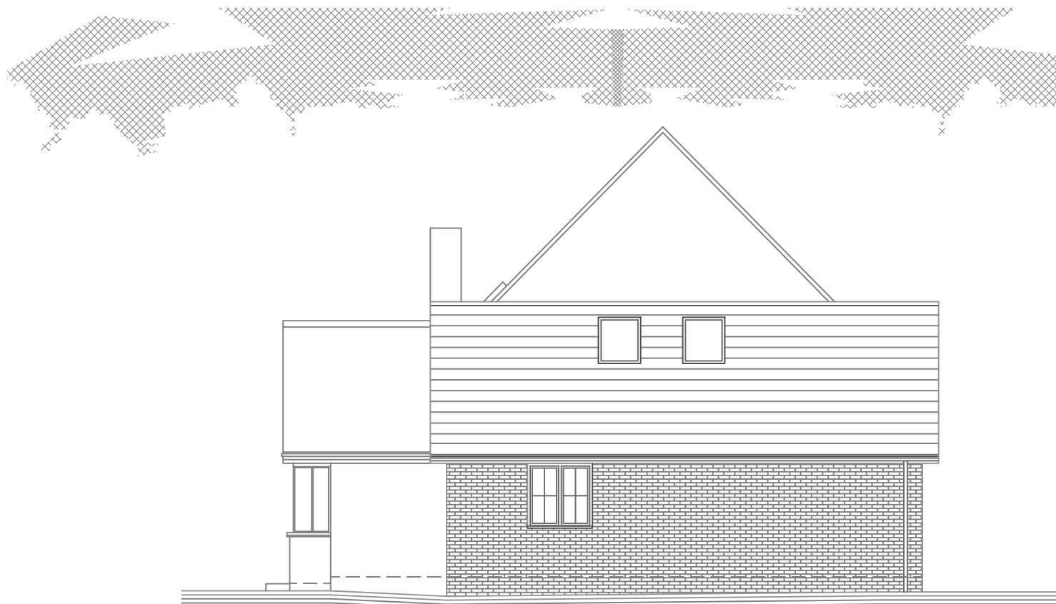
Proposed Side Elevation 2 (North-east facing)