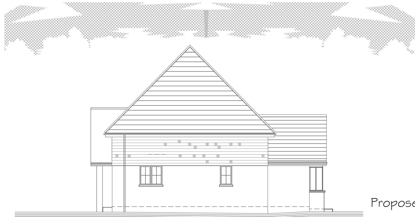
Proposed Side Elevation 1 (South-west facing)