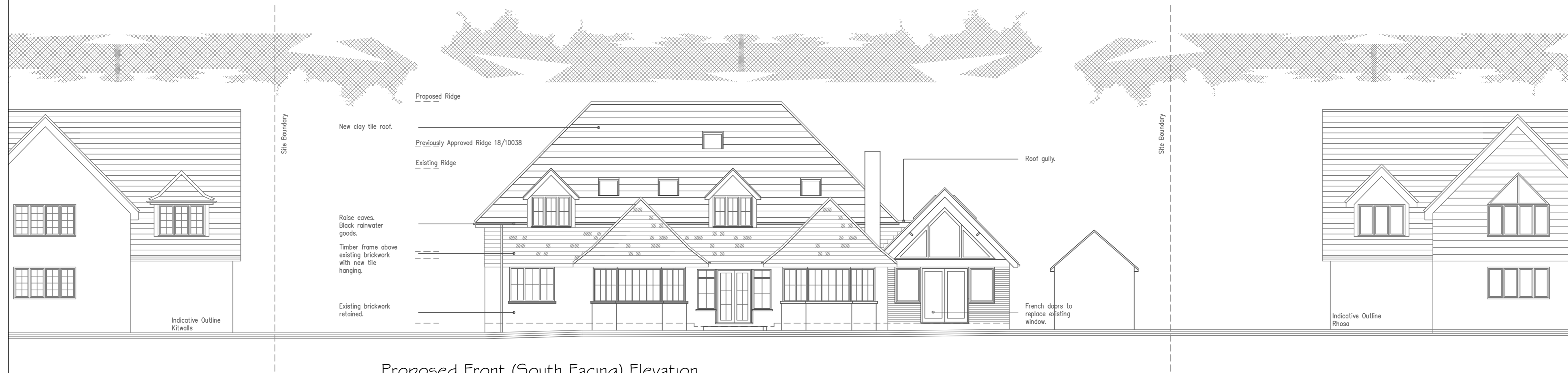
Proposed Front (South Facing) Elevation