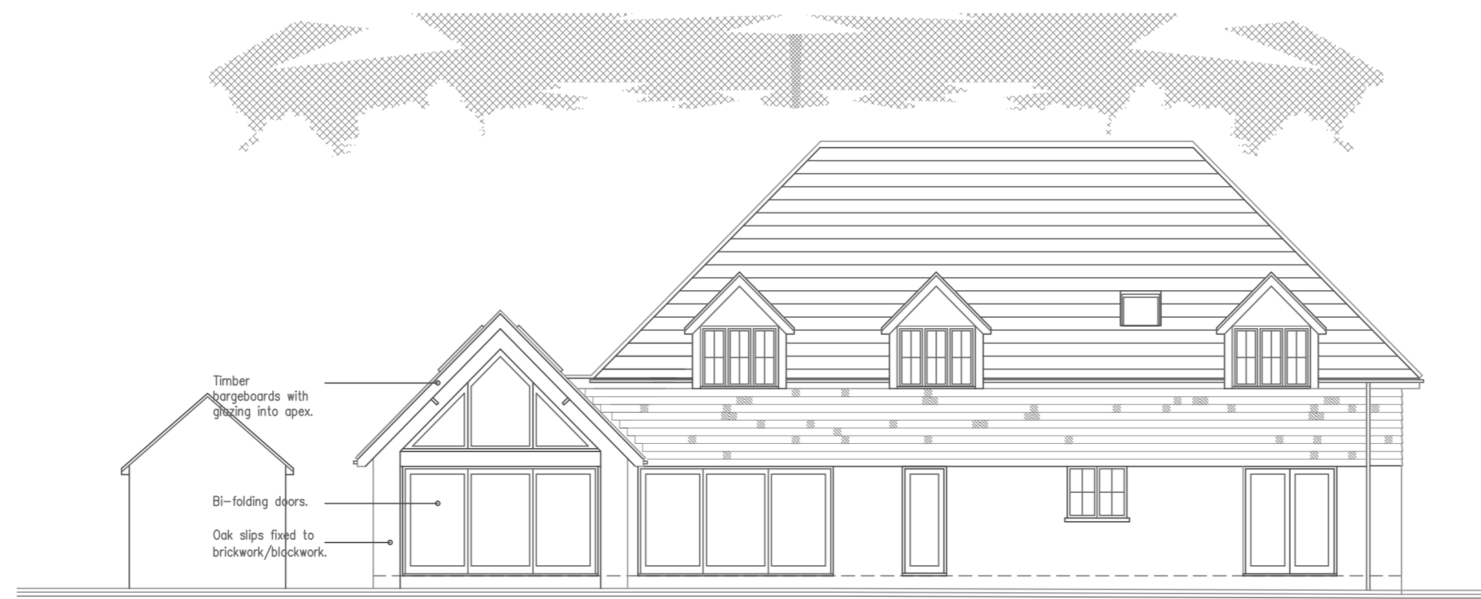
Proposed Rear (North Facing) Elevation