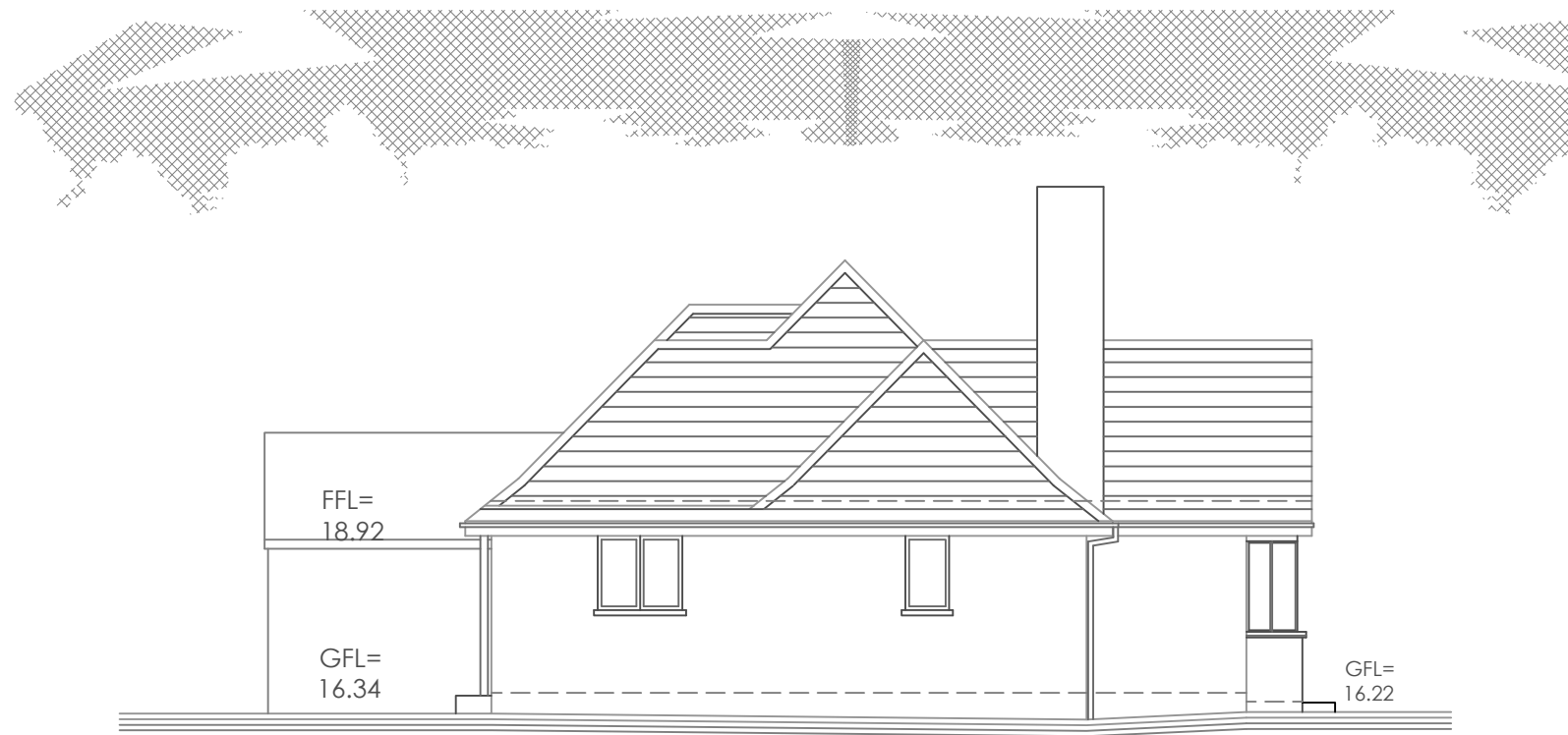
Existing (West Facing) Side Elevation 1