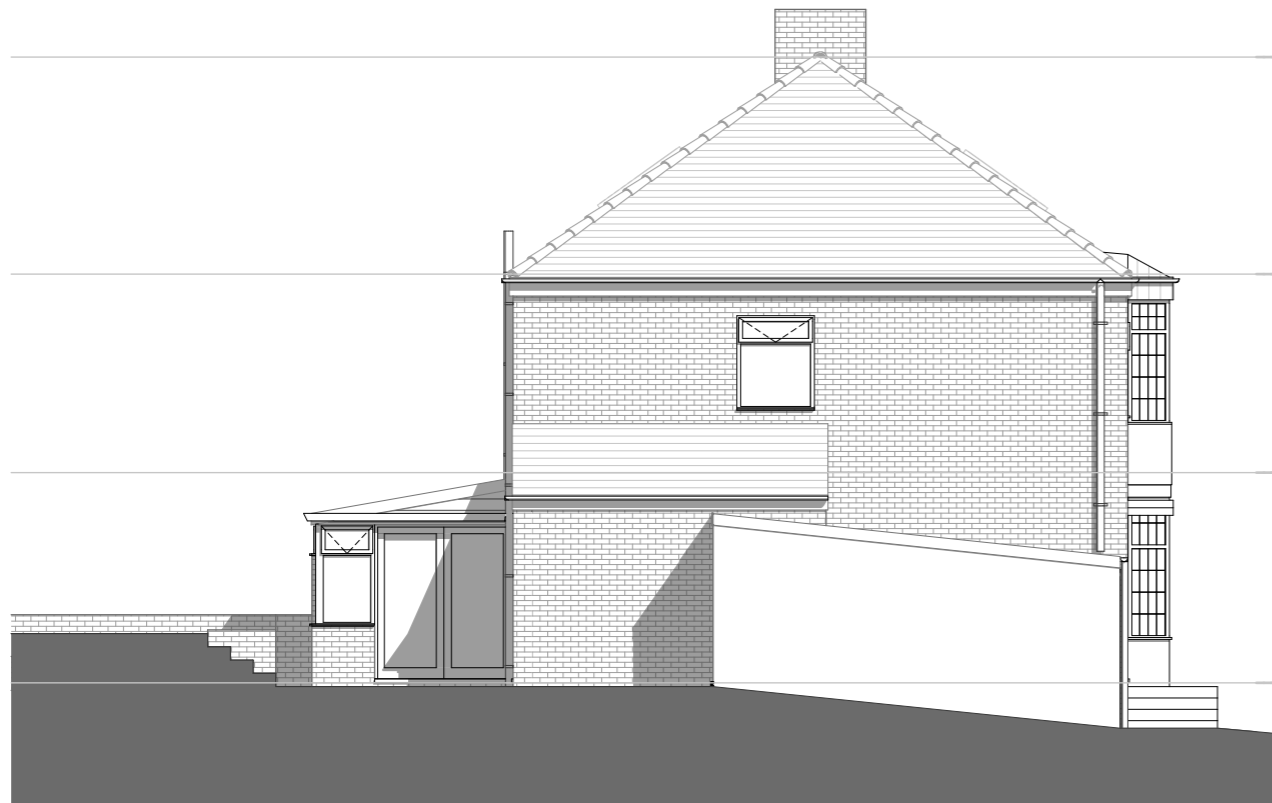
E-03 Existing North East Elevation 1:100