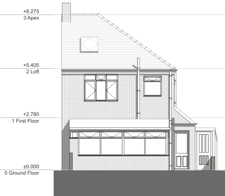
E-02 Existing South East Elevation 1:100

NOTES Builder to check and clarify all levels, dimensions, drainage construction & specification prior to any works on site and to bring to the clients attention any variations or deviations for written confirmation before being carried out on site.