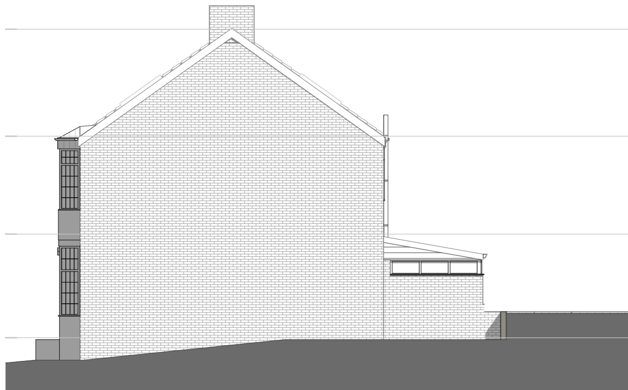
E-04 Existing South West Elevation 1:100