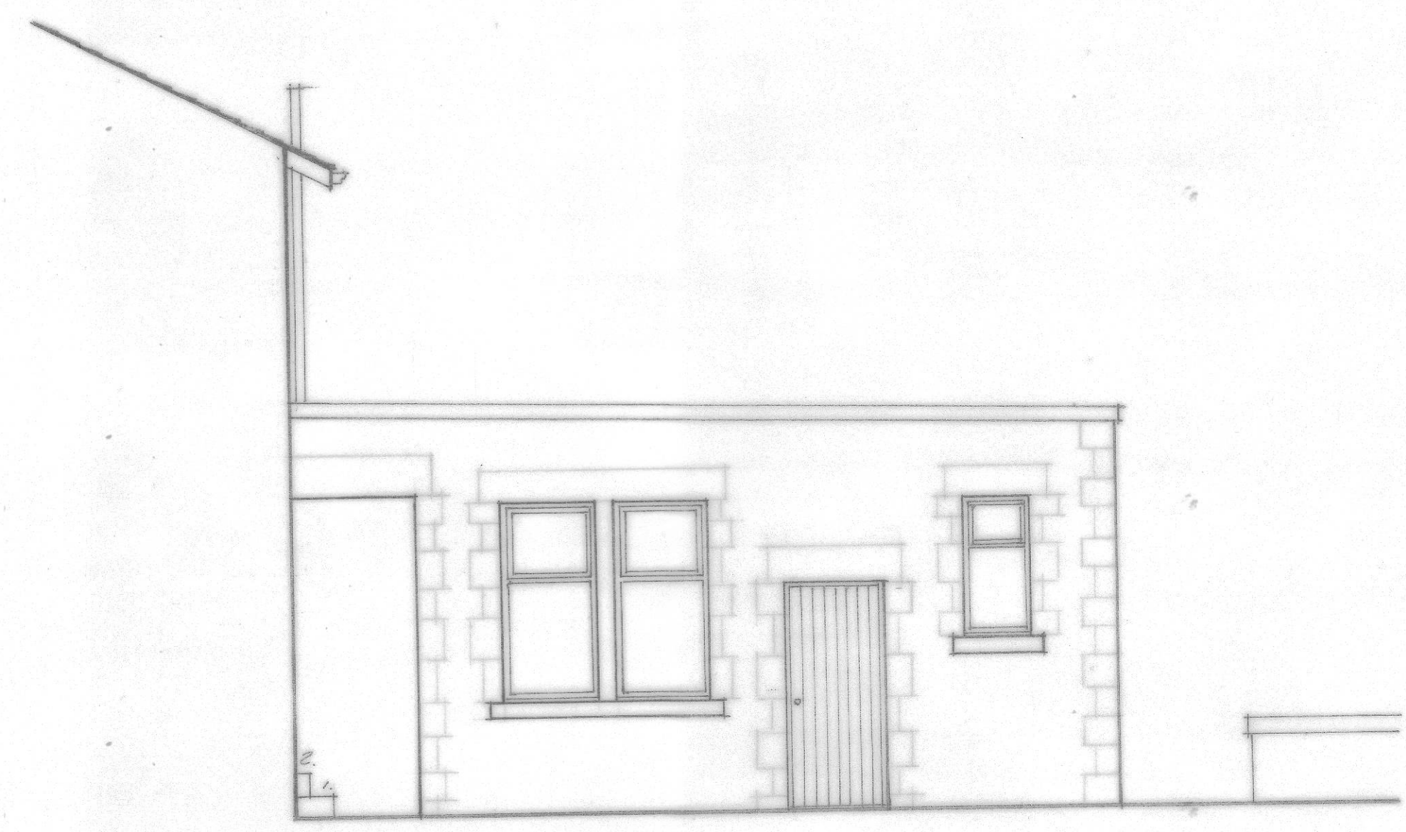
South Elevation as Existing · 1:50.