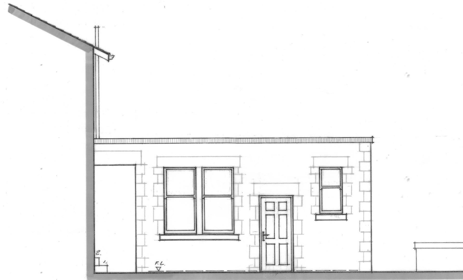
South Elevation as Proposed · 1:50.