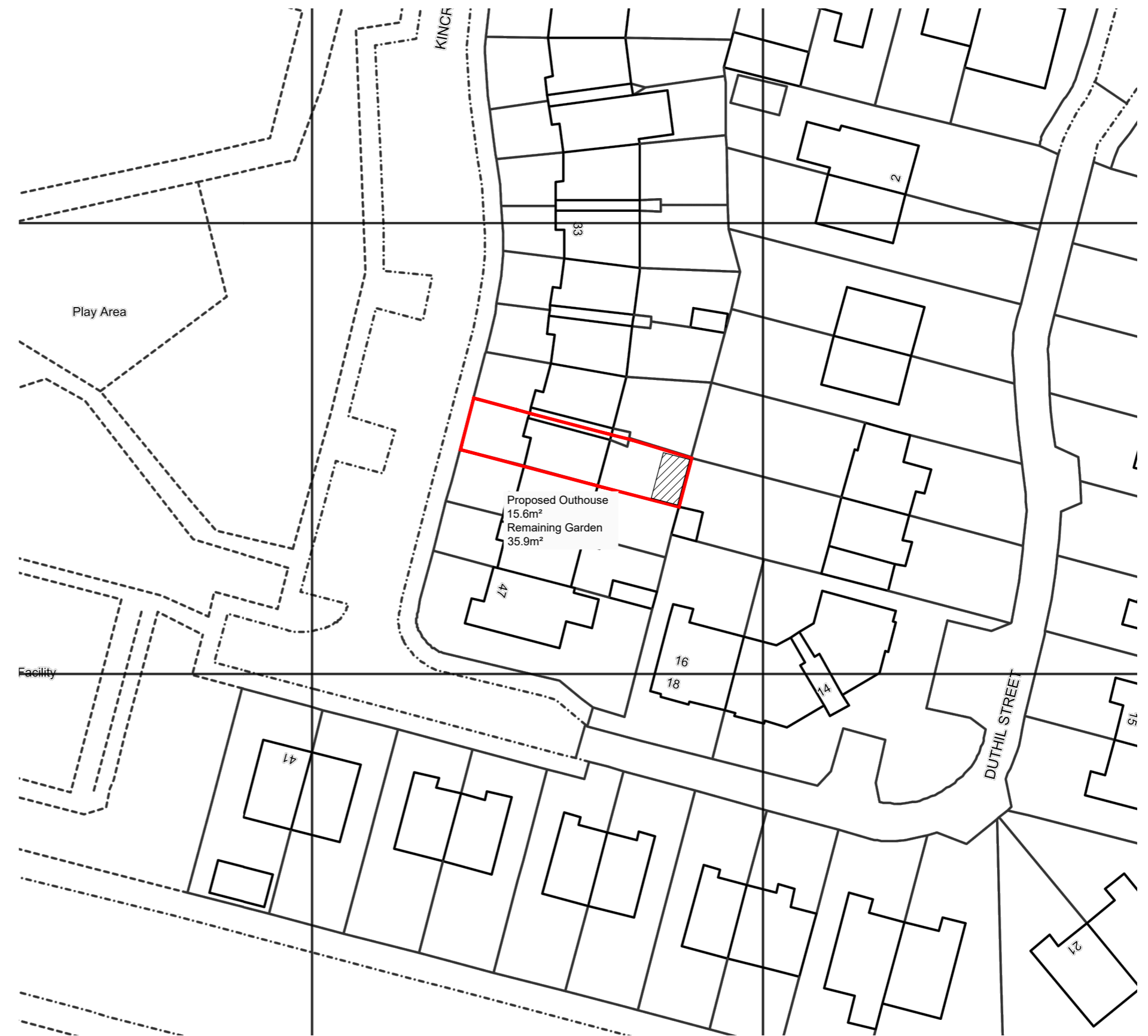
Block Plan as Proposed (1:500)