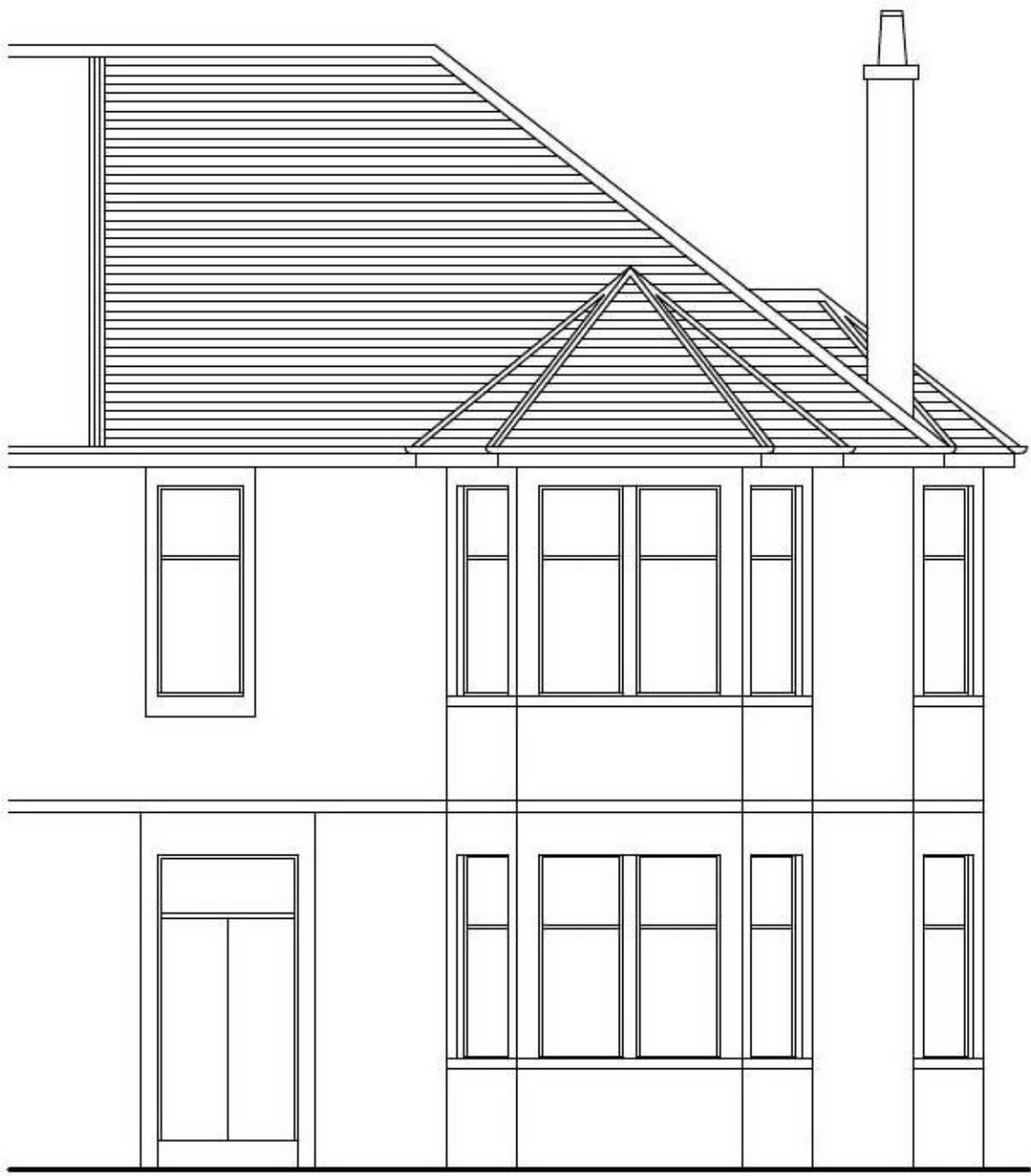
NORTH ELEVATION AS PROPOSED.