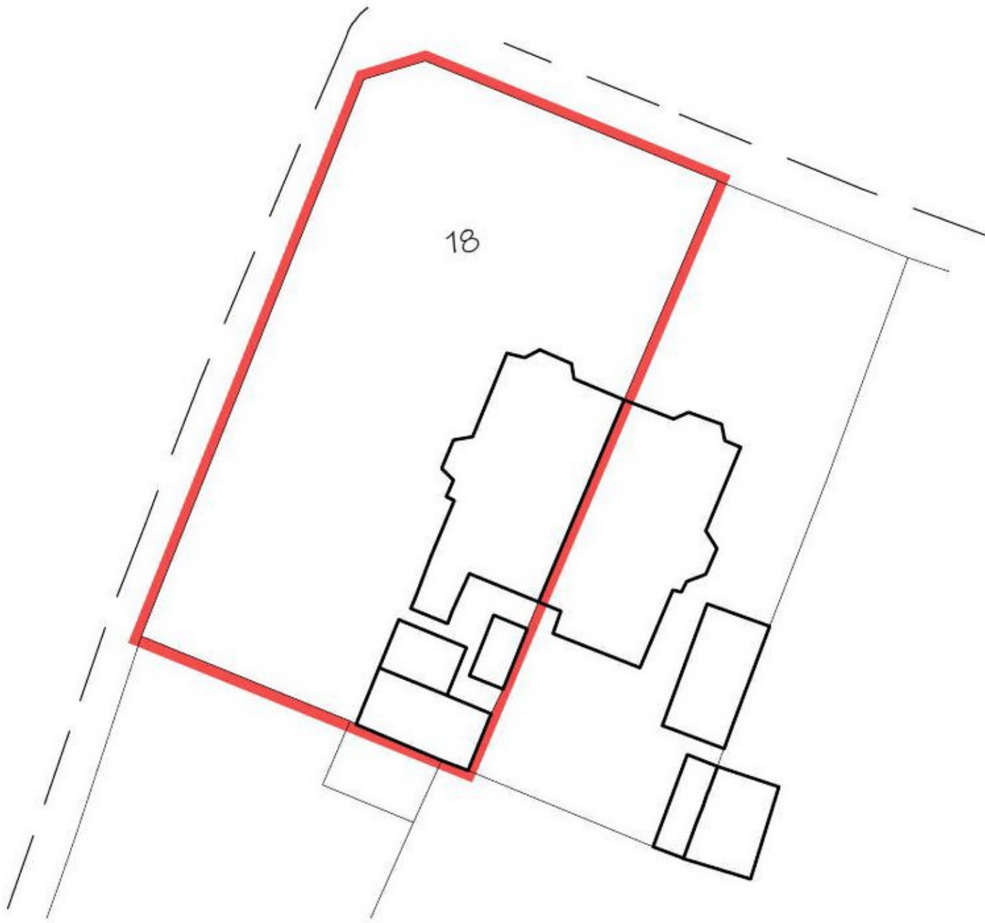
BLOCK PLAN 1:500.

Matacouta heavy slate is widely used throughout Scotland as an alternative to indigenous scottish stone. The extra depth of the slate blends in with the traditional Balachulish slate which is no longer available, adding character to the building.