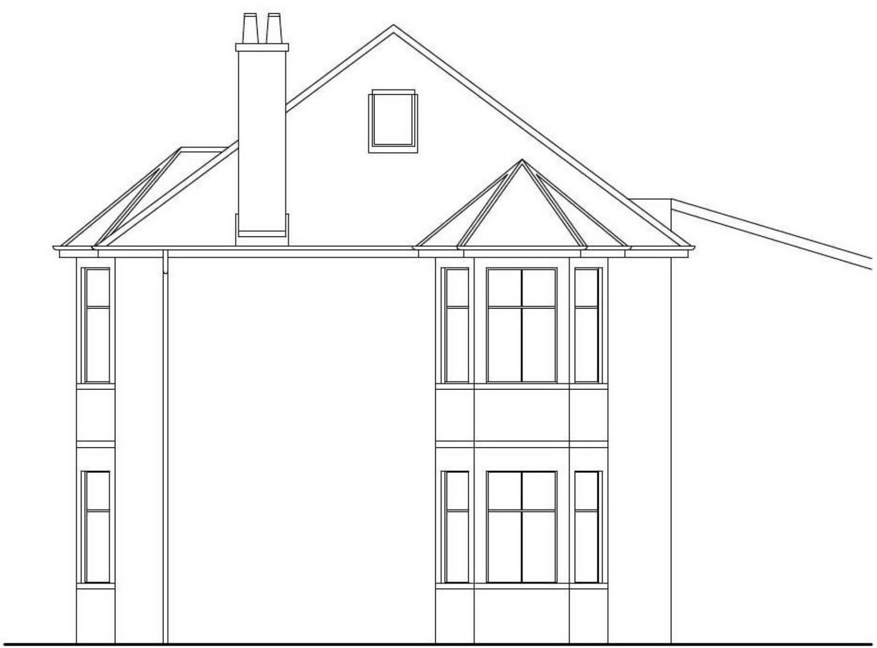
WEST ELEVATION AS EXISTING.