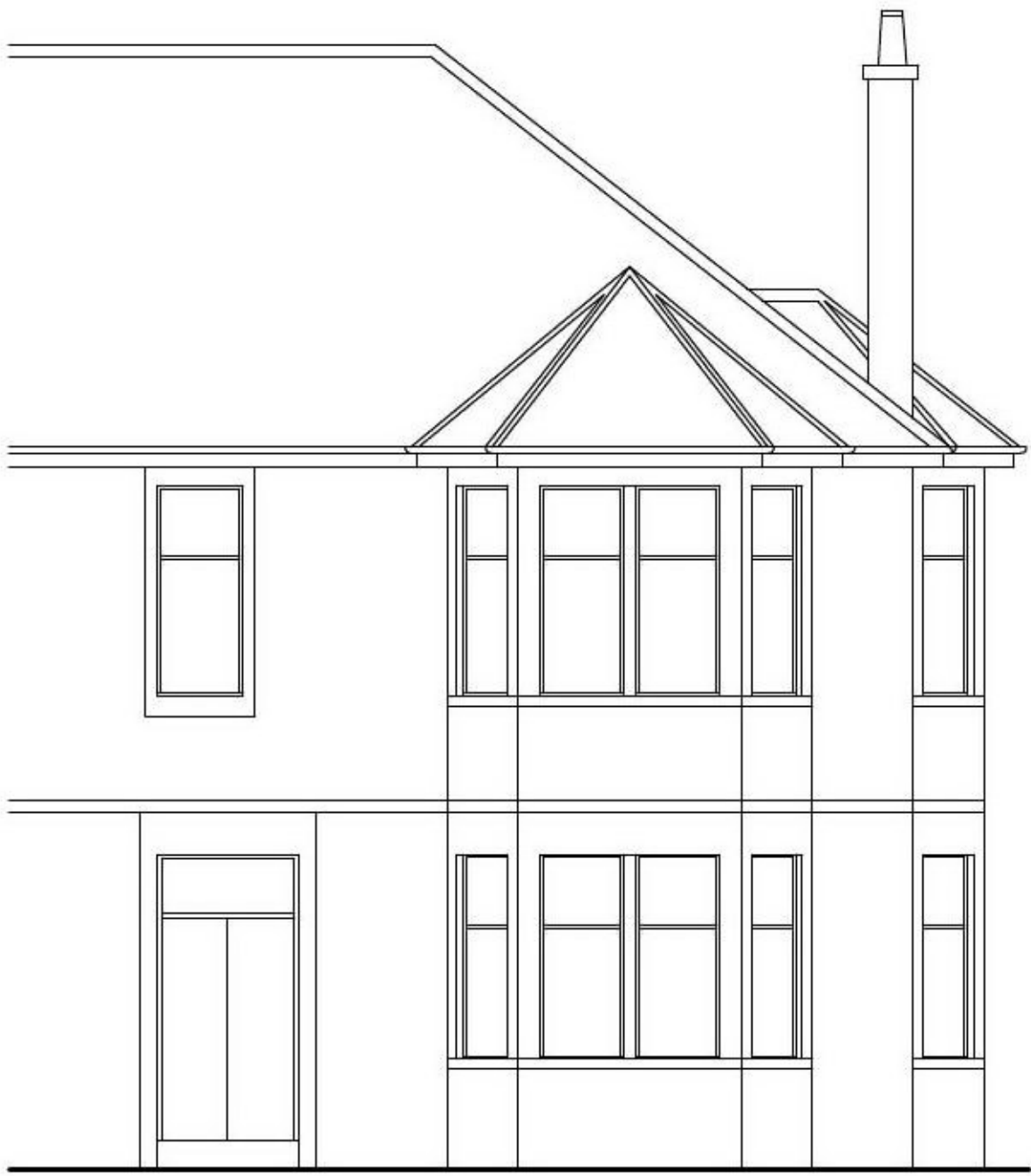
NORTH ELEVATION AS EXISTING.