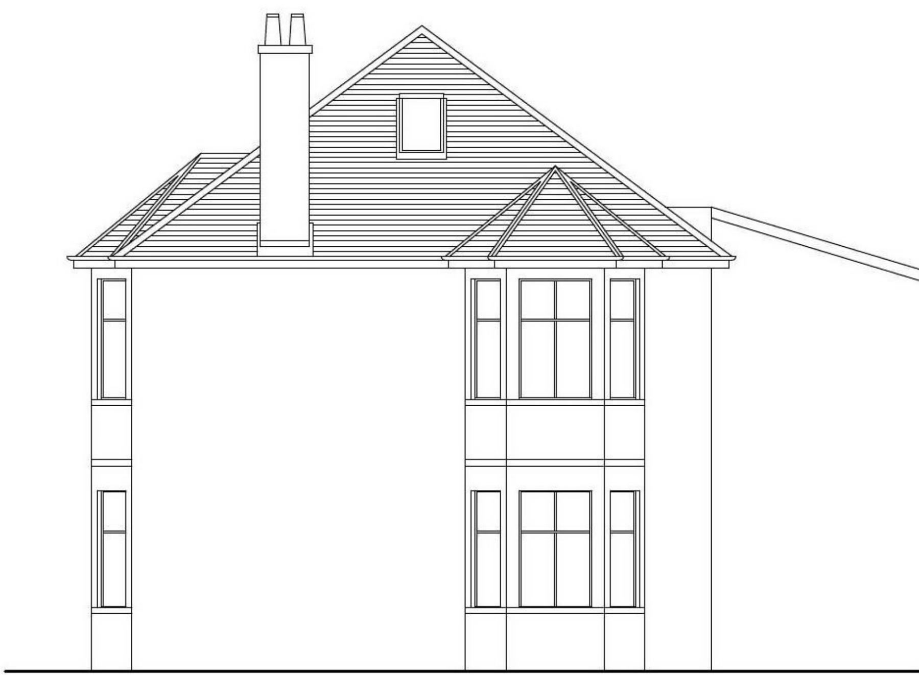
WEST ELEVATION AS PROPOSED.