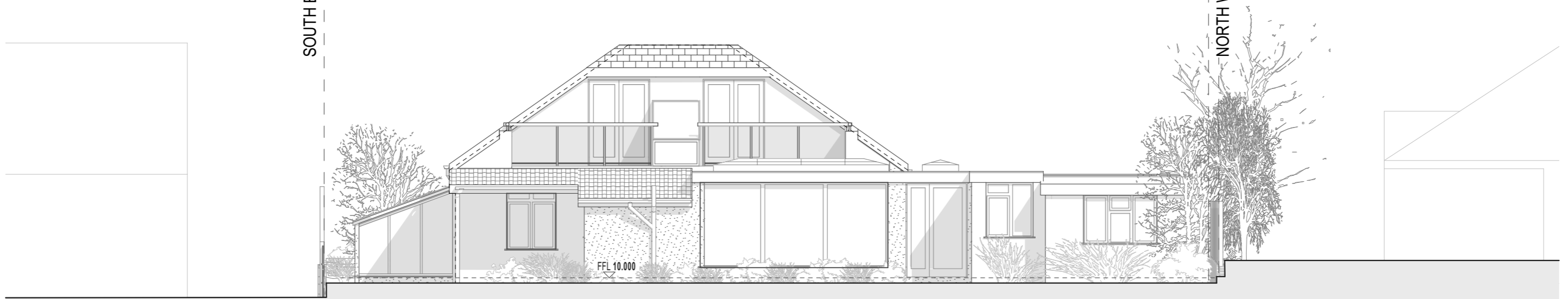
NORTH EAST ELEVATION 1:100