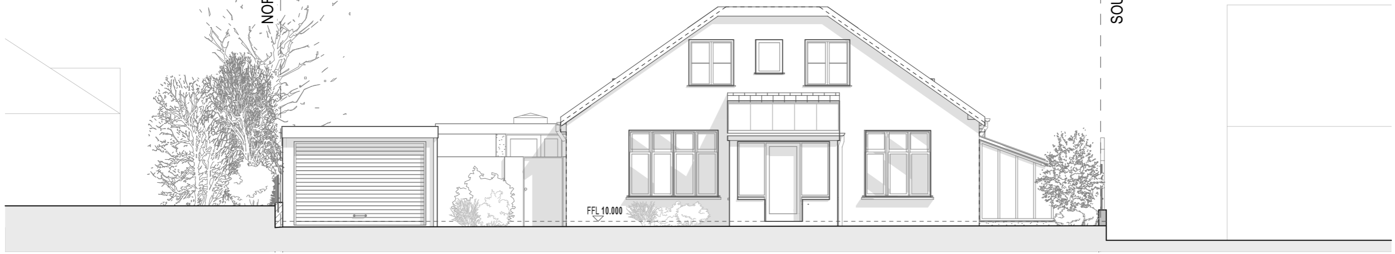
SOUTH WEST ELEVATION 1:100