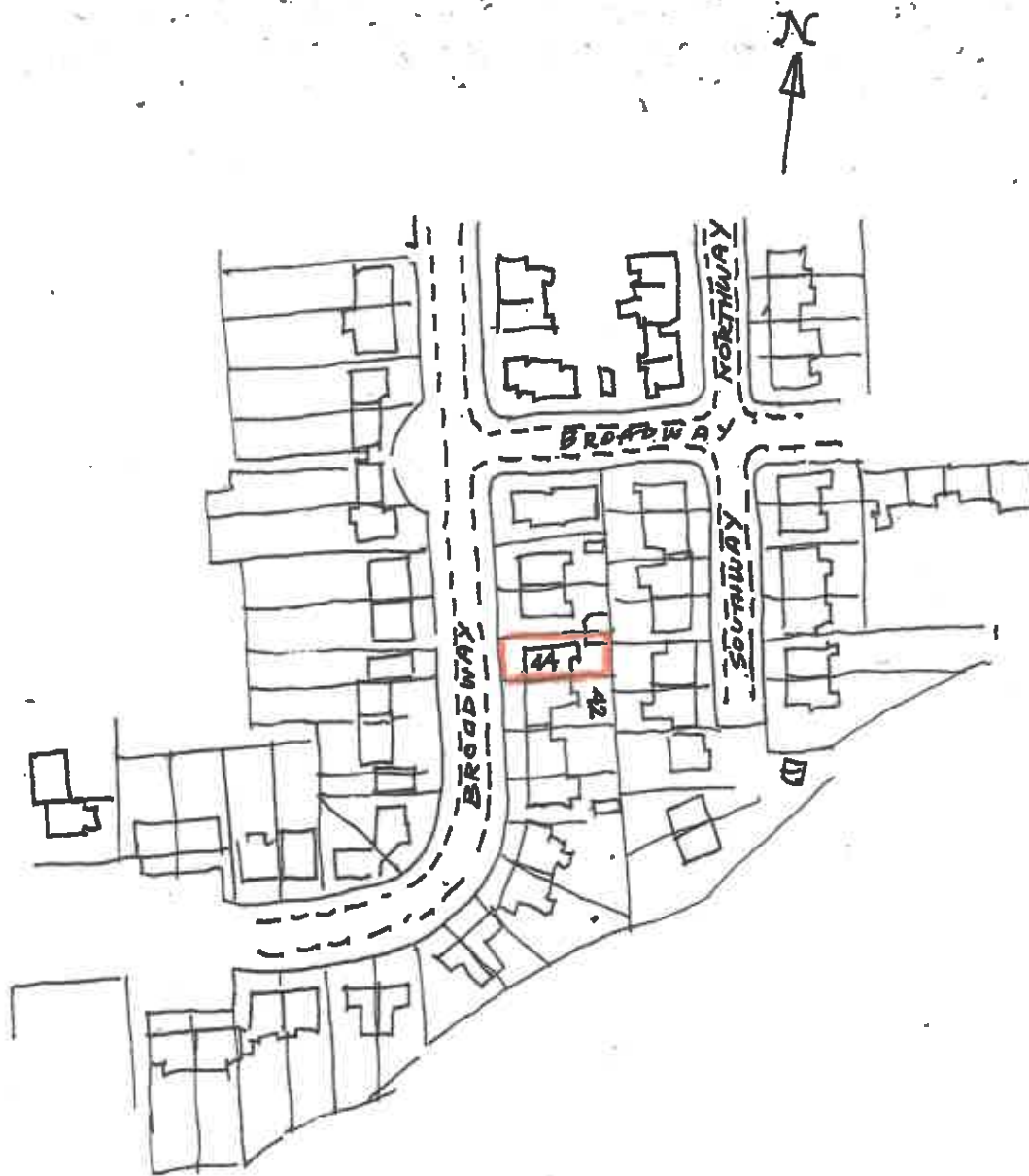
44, BROADWAY, DROYLSDEN LOC. PLAN 1:1250 © A4