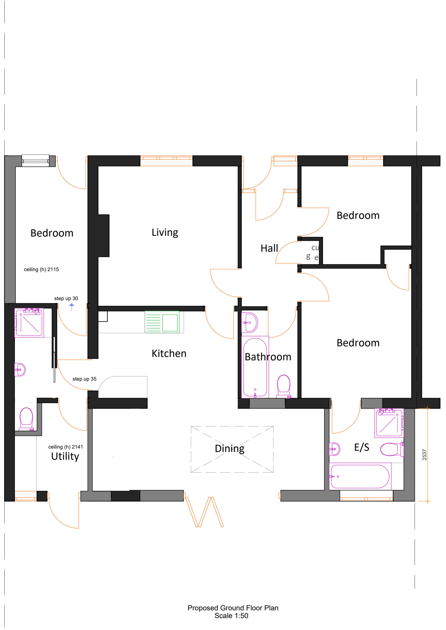
Proposed Ground Floor Plan Scale 1:50