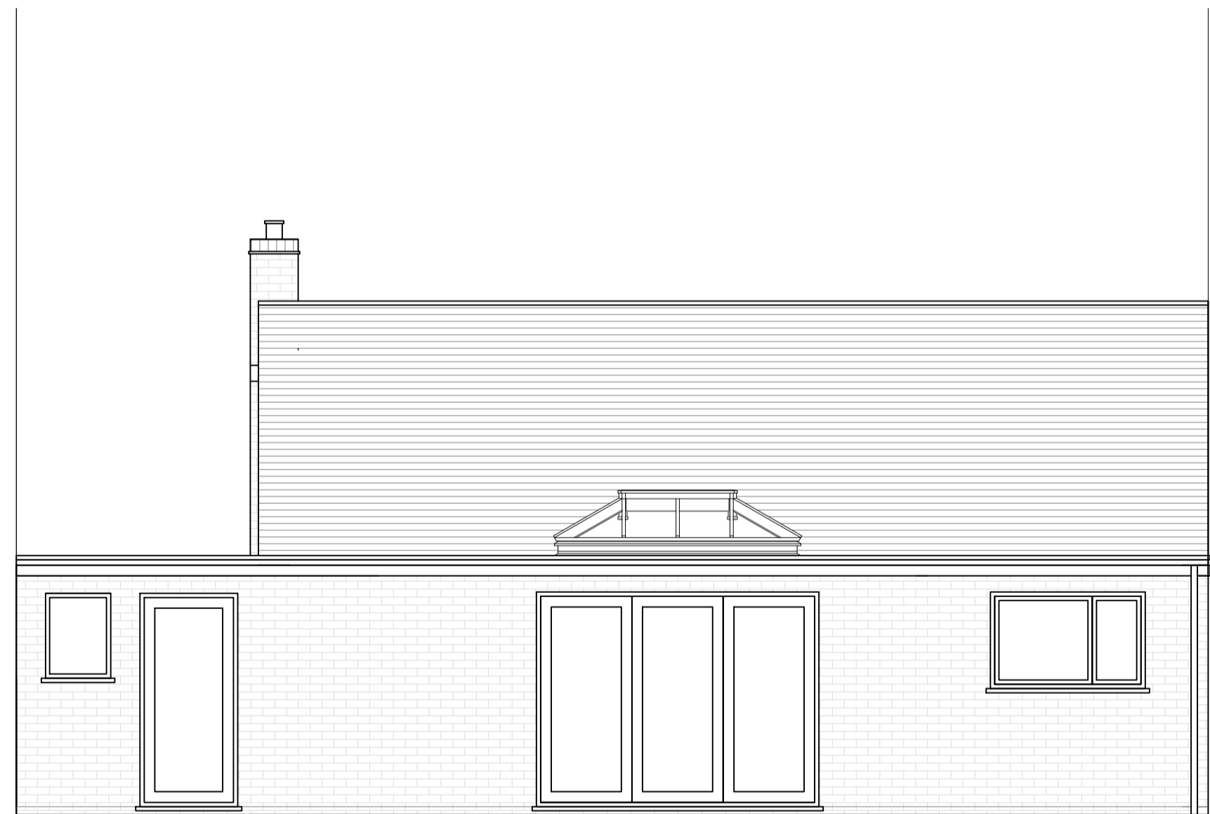
Proposed Rear Elevation Scale 1:50