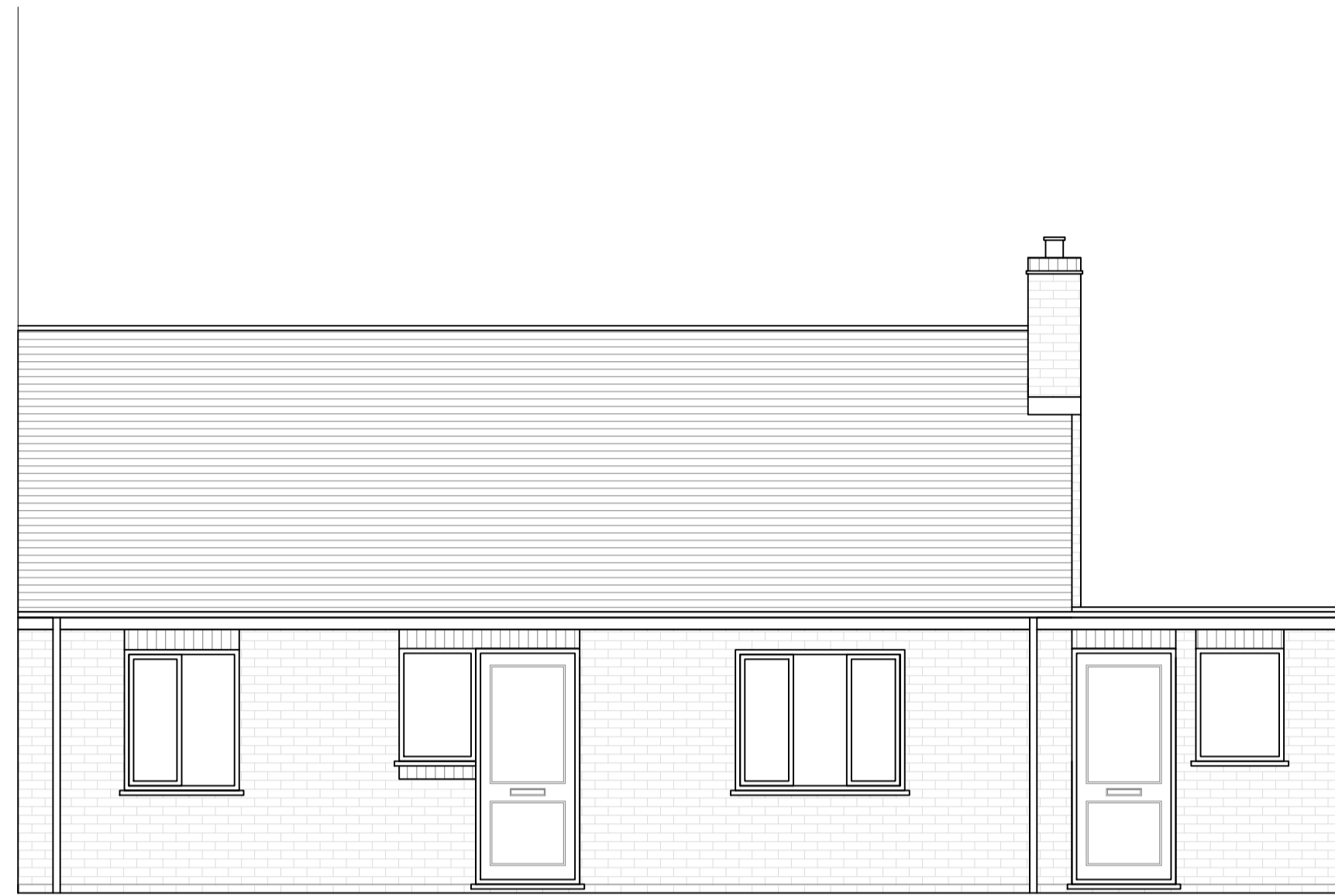
Proposed Front Elevation Scale 1:50