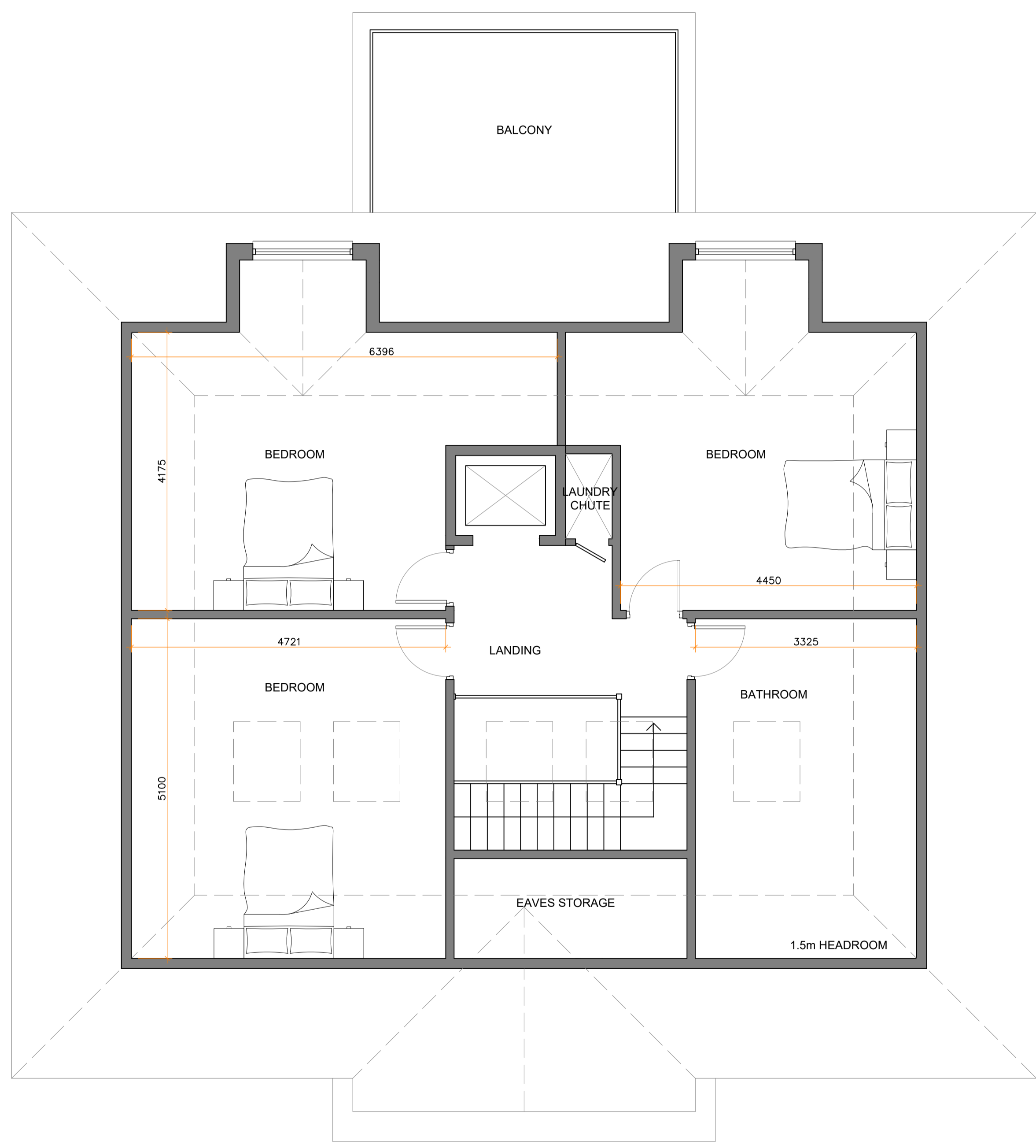
Proposed Loft Plan Scale 1:50