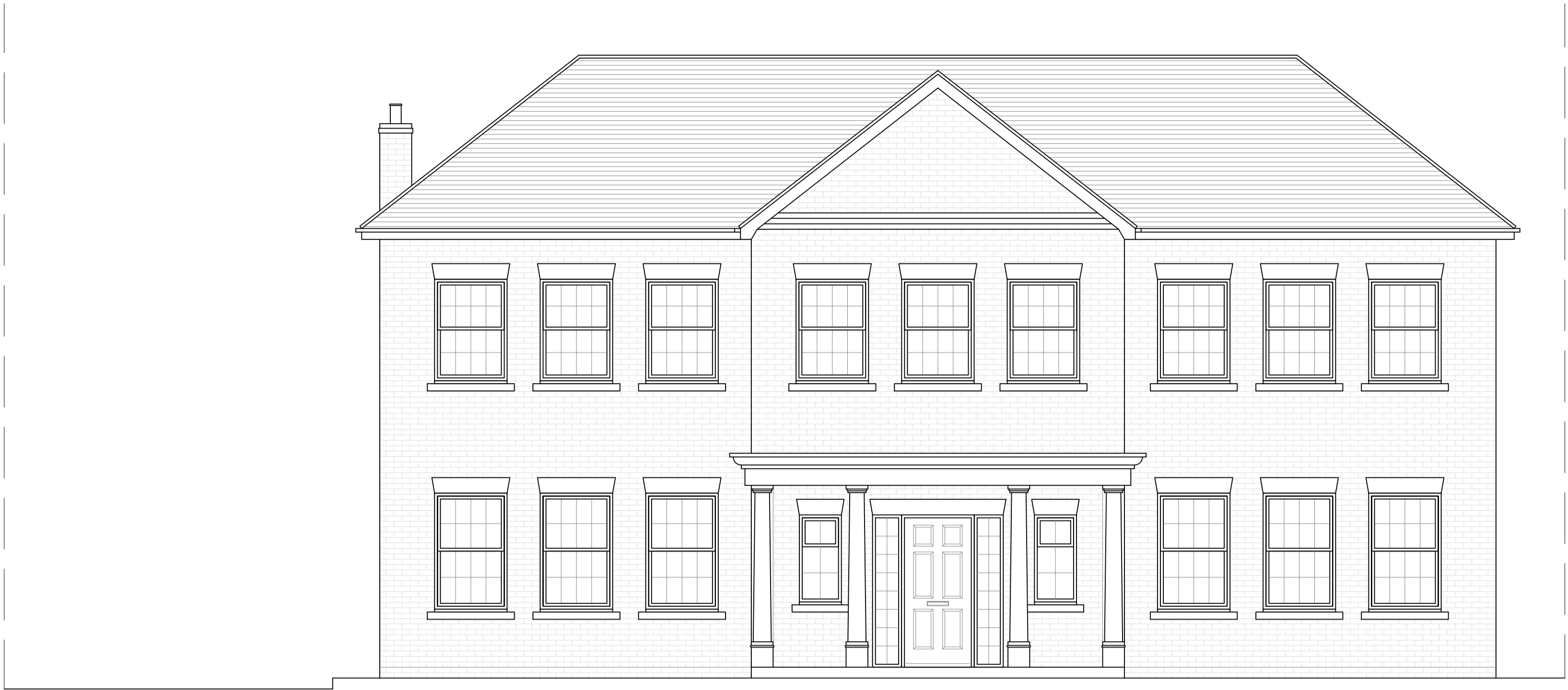
Proposed Front Elevation Scale 1:50