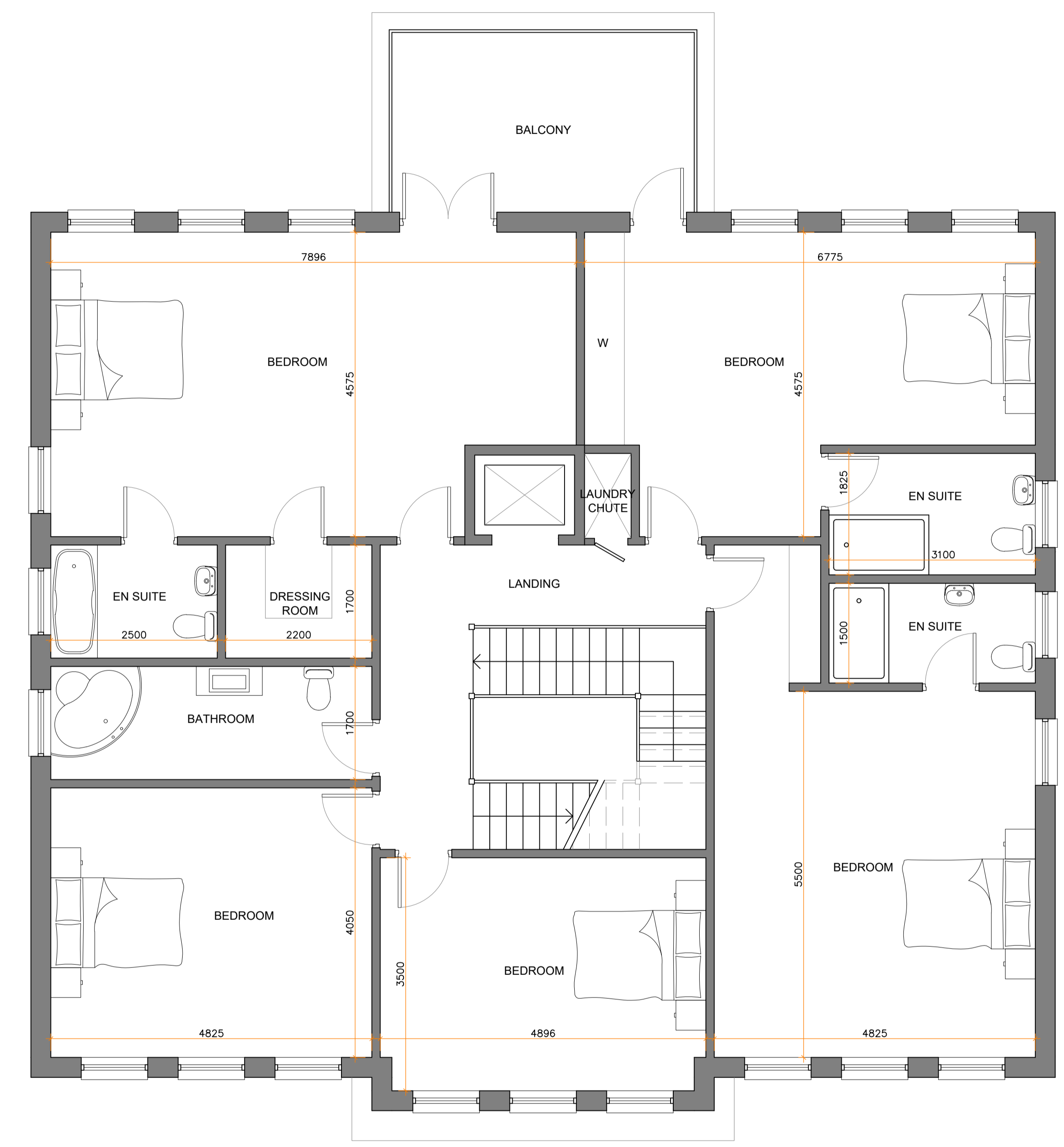
Proposed First Floor Plan Scale 1:50