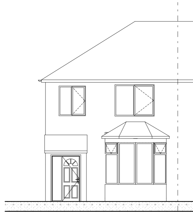
FE Front Elevation (1) 1:100