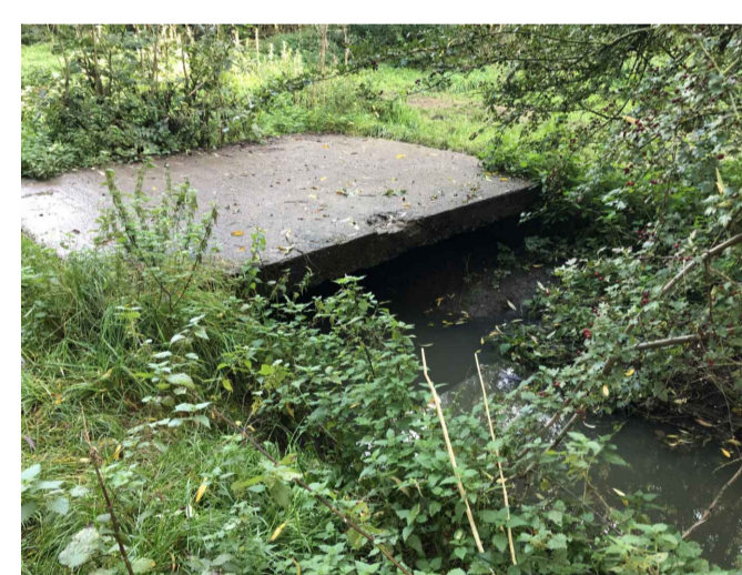
Existing Culvert 'B'