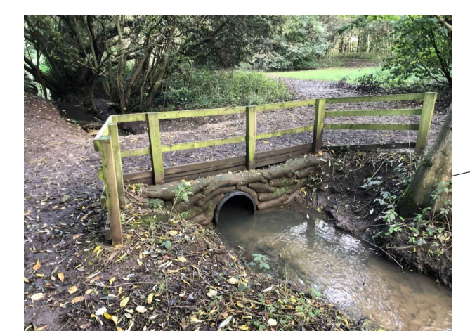
Existing Culvert 'C'