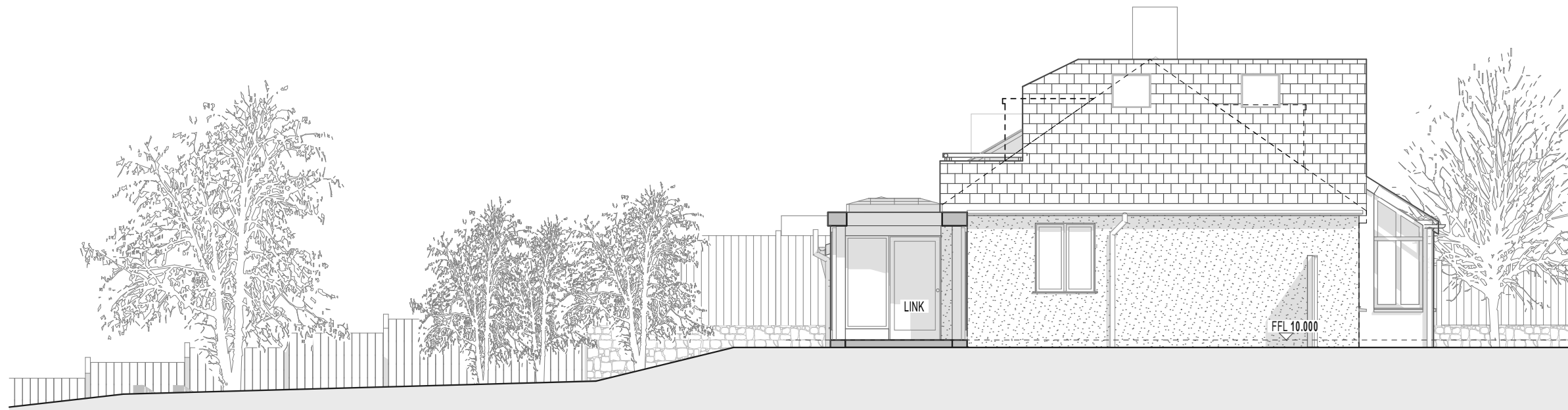
NORTH WEST ELEVATION 1:100