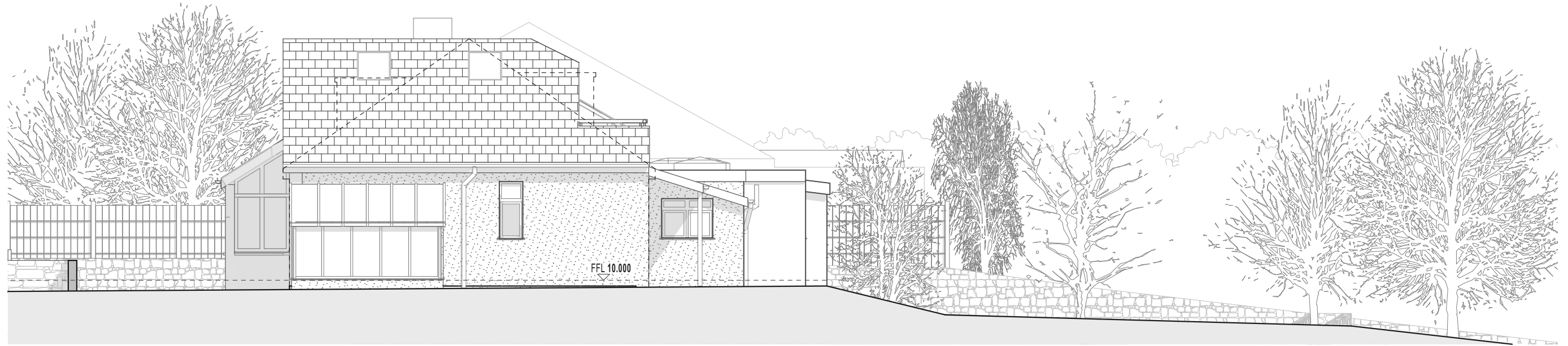
SOUTH EAST ELEVATION 1:100